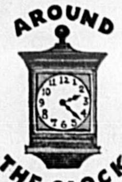
By JOHN A. SPOLSKI

DAYTONA BEACH (AP) — Three Orlando men were in jail today under $75,000 bond each after, police say, they engaged in a 30-minute weekend gun battle with officers over a plane of marijuana on an abandoned airstrip. Police said the men were attempting to reach a small plane stuffed with $1.1 million in marijuana that was parked on the well-grown runway in a remote area near here.