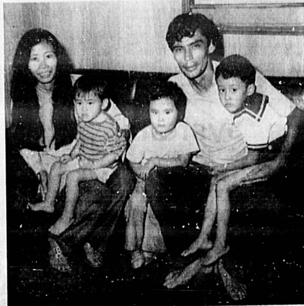
AT LONG LAST