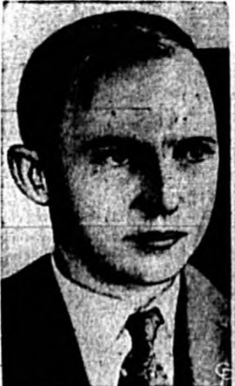
Prof. Harlow Shapley At the inauguration of the new academic year of the Pontifical Academy of Science in the Vatican gardens in Rome, the Pope announced that Professor Harlow Shapley, director of the Harvard Observatory in Cambridge, Mass., has been assigned the Plus XI Prize for Astronomy. Shapley has been director of the Harvard University Observatory since 1921.