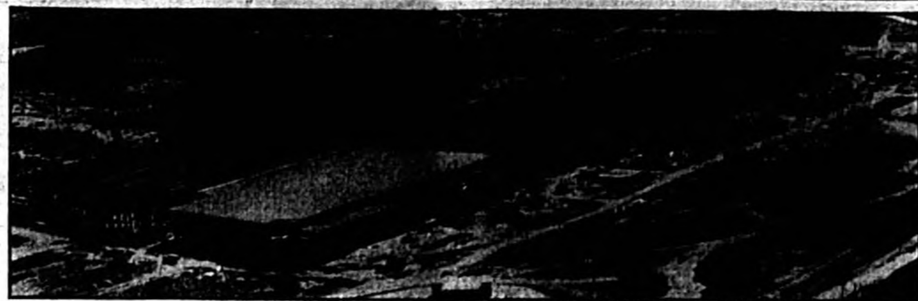
THIS AERIAL PHOTO shows the huge $47,000,000 bomber plant the Ford Motor Company is building at Willow Run, near Ypsilanti, Mich. In the foreground is the nearly completed manufacturing section, which forms the lower part of the "L" shaped plant. Only half of the actual length of the assembly building is shown in the photo. Ford will produce giant four-engine Consolidated B-24 bombers in the Willow Run plant. Construction work has advanced so rapidly a tool room already is in production in the new structure.