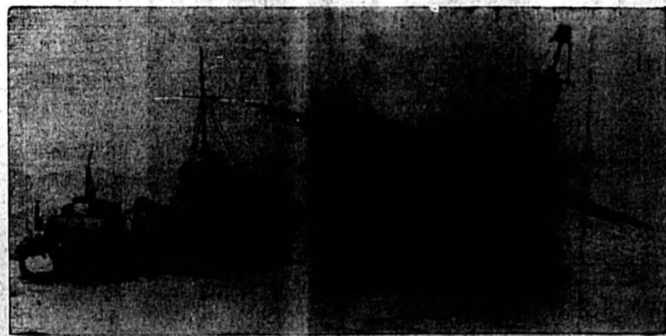
A destroyer working up alongside the sinking British aircraft carrier Ark Royal to take off officers and crew, after the giant warship was torpedoed in the Mediterranean Sea near Gibraltar. Only one of the "Ark's" 1,576 officers and crew was lost in the sinking.