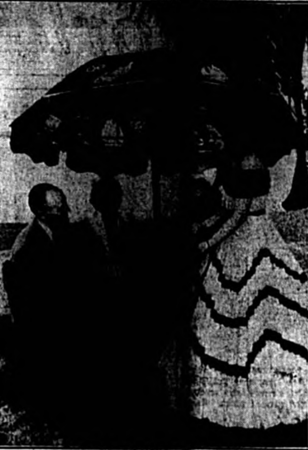
Cypress Gardens, Florida.—When Richard Kent, famed in magazines and radio as "The Traveling Cook," tasted Queen Elizabeth's Orange Shortcake as a climax to a citrus dinner at Cypress Gardens, he pronounced it "perfect" and one of the most delicious desserts he had tasted in all his travels over the world.

and lower at 25c. Includes 1000 cards, 1000 envelopes, 1000 stamps of 1¢ and 2¢.