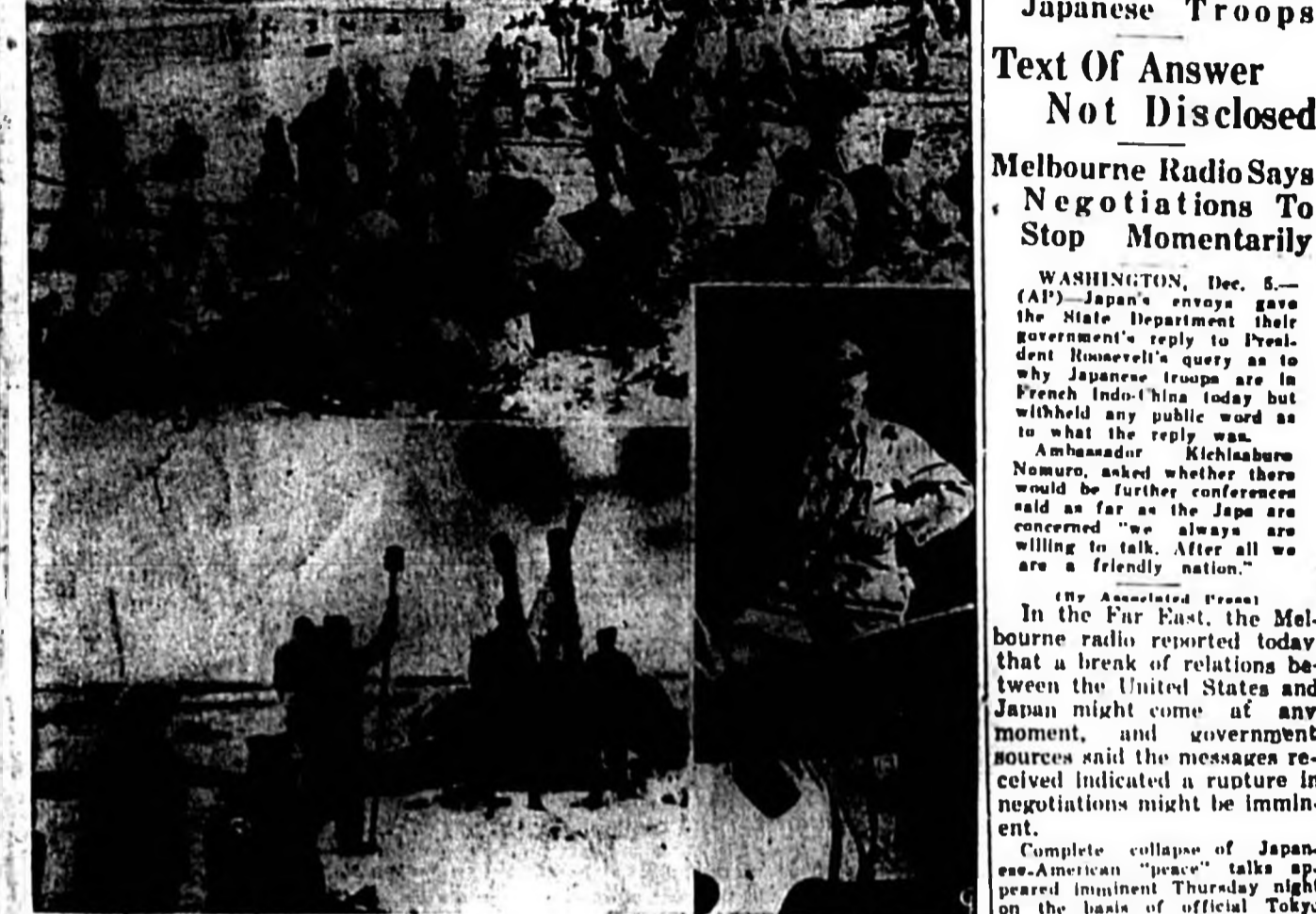
These pictures just received in the United States show the opening of the present British drive into Libya. Top, a view on a North African beach showing British troops tooling off in the surf. Bottom, left, British artillery goes into action. Right, we see Lieut. Gen. Sir Arthur Cunningham, in command of the British troops in Libya on a plane wing just before he took off on a reconnaissance flight over the Western desert.