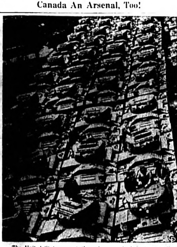
The United States is not the only arsenal of democracy. Here, in Montreal, is a mass of tanks right off the assembly line, being fitted with powerful guns throwing 2-pound shells, flame throwers and other armament. Known as "Valentines," the tanks weigh approximately 20 tons and have a top speed of 25 miles an hour.