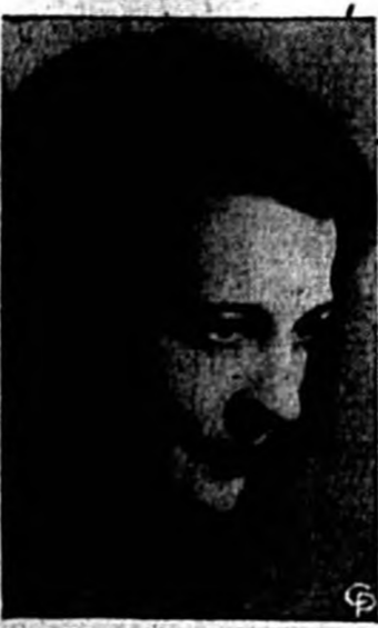
Margaret Webster Having won acclaim on Broadway with her staging of Shakespeare's plays, Margaret Webster promptly had her appendix removed when "Hamlet" with Judith Anderson and Maurice Evans opened to packed houses. Miss Webster will soon leave the hospital and get an opportunity to see her best job—a month after it opened.