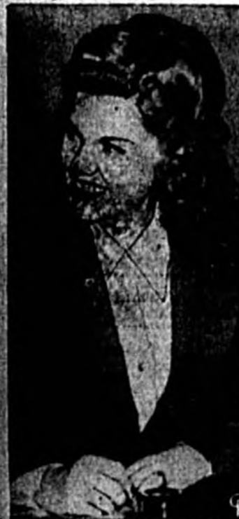
Joyce Mathews Joyce Mathews, singer, and Milton Berle, film comedian applied for a marriage license at Los Angeles, after she said "yes" by telephone from Los Angeles to New York, where she was appearing in a musical show.