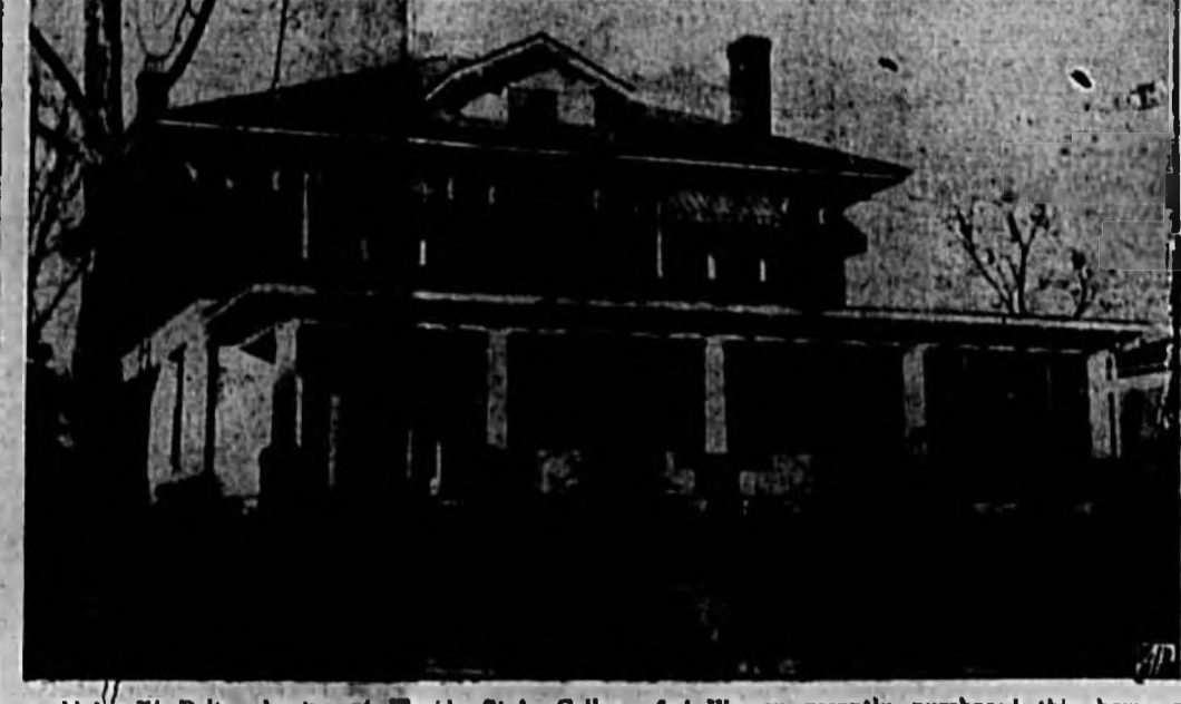
Alpha Xi Delta chapter of Florida State College for Women recently purchased this home on West College Avenue in Tallahassee. It will be dedicated in February and alumnae will be invited to attend. The Alpha Xi's bought the tenth sorority to buy a house at Tallahassee.