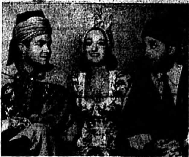
"Road To Morocco" third in the triumphant series of comedy Crosby, will be shown at the Ritz Theatre next Sunday and Monday...