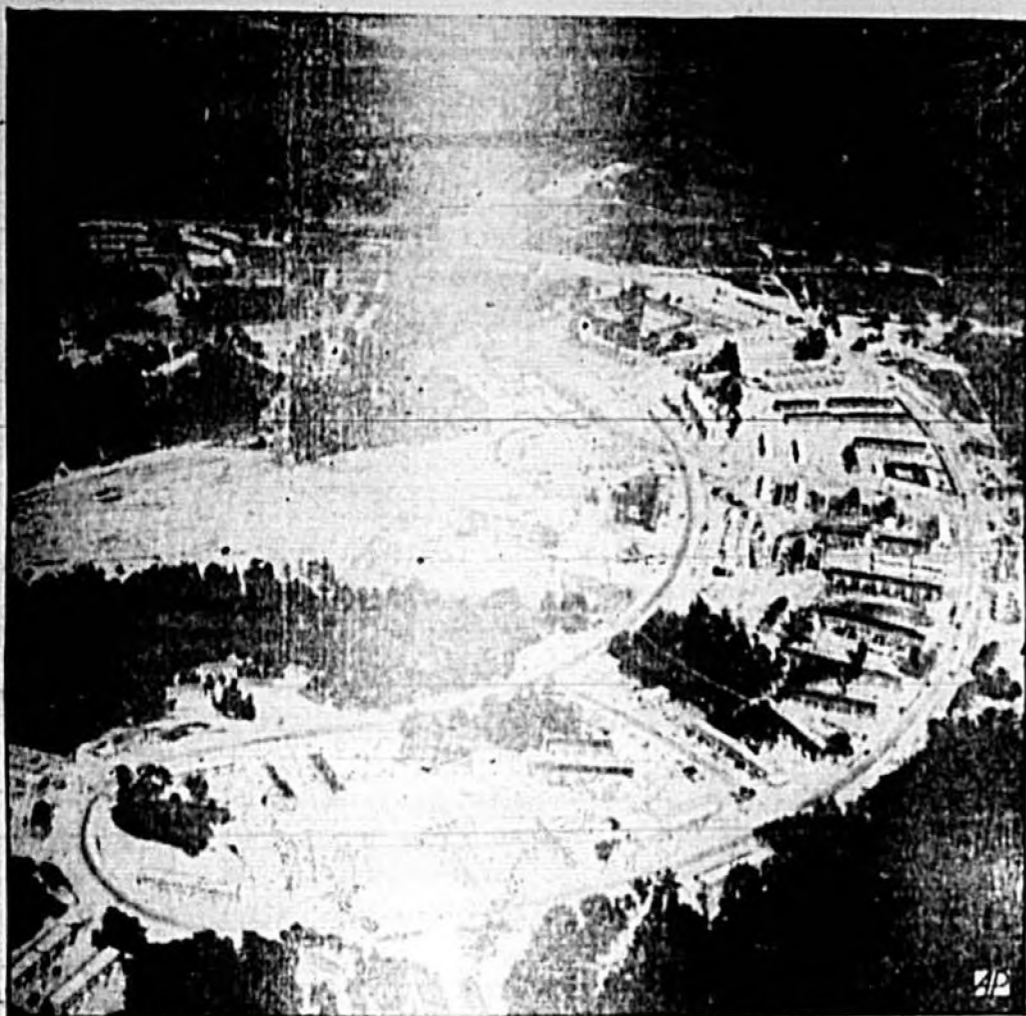
THE HOUSE THAT JACK BUILT was a far cry from the houses that $12,000,000 of Resettlement Administration funds have constructed at Greenbelt, just across the Maryland state line from the District of Columbia. Designed to eliminate slums, they are ultra-modern. Counterclockwise around the outer circle are residential blocks A, B, C, D and E. In the center is a school, above it a parking lot, and above that the business district.