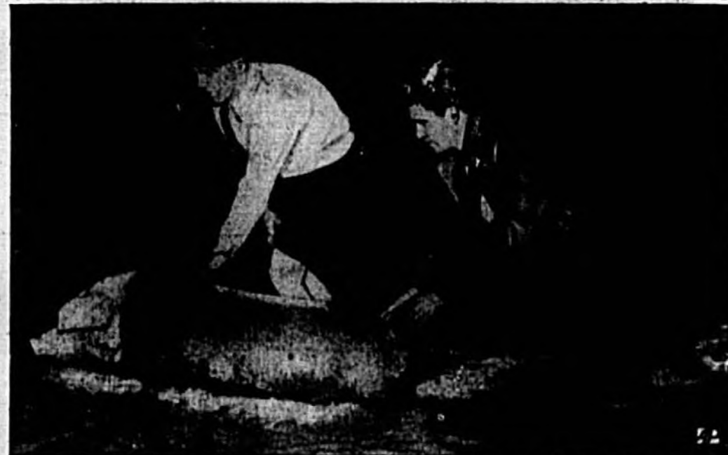
THIS LITTLE PIGGY WENT TO MARKET , but before he got there he wished he'd stayed home. For the wandering porker was caught in flood waters in a low-lying section of Washington, D. C. A street car motorman and conductor, marooned in their car, heard the frantic squeals of the animal being swept away in the rush of the flood stream and went to its rescue.