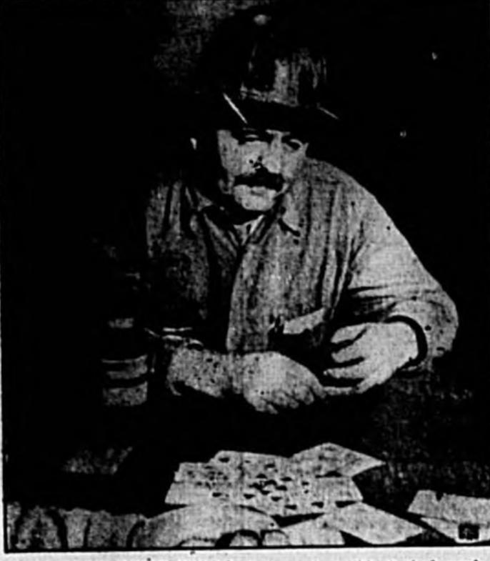
IT'S THE NEW DEAL that employs this typical workman in the construction of Grand Coulee dam in Washington. Like the frontier towns of gold rush days, the boom cities near the dam are cluttered with entertainment spots. Hard-working men need relaxation and the nearest city of any size is 100 miles distant. The recreation halls run 24 hours a day. No hard liquor is served.