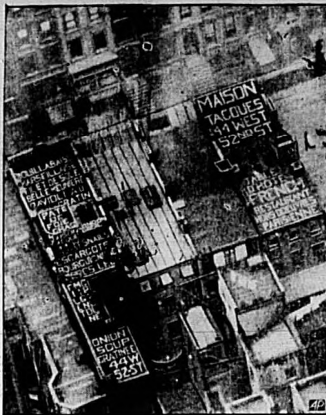
HIGH-CLASS ADVERTISING is this menu on the roof of a French restaurant in New York City, painted in letters two by four feet for the benefit of hundreds of workers, laboring high above the streets in Rockefeller Center's office buildings.