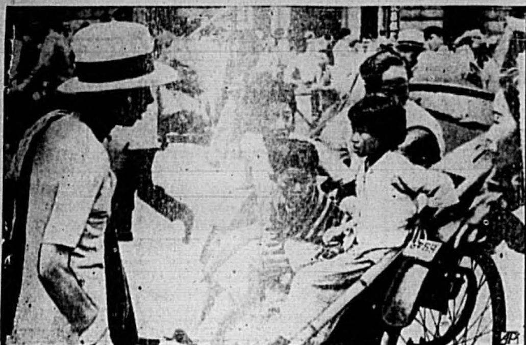
INNOCENCE ABROAD , youthful faces reflecting fear of war, filled Shanghai's streets as thousands fled from death and fire as bitter warfare raged between China and Japan. Chaos was everywhere as airplanes rained cargoes of death into streets clogged with fleeing humanity. Even the International Settlement provided no haven as bombs exploded in its thoroughfares, killing hundreds, wounding hundreds more.