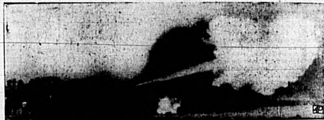
LEARNING TO BE A BIG SHOT is part of the training of West Point cadets. Here a group of future officers putting class room theory into practice in a favored manner with 155 mm. guns on their annual visit to the range at Fort Belvoir.