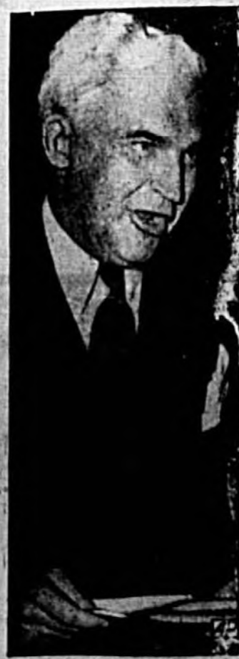
MOOSIER HOPE for the Democratic presidential nomination in 1940 is Paul V. McNutt (above), high commissioner of the Fallington.