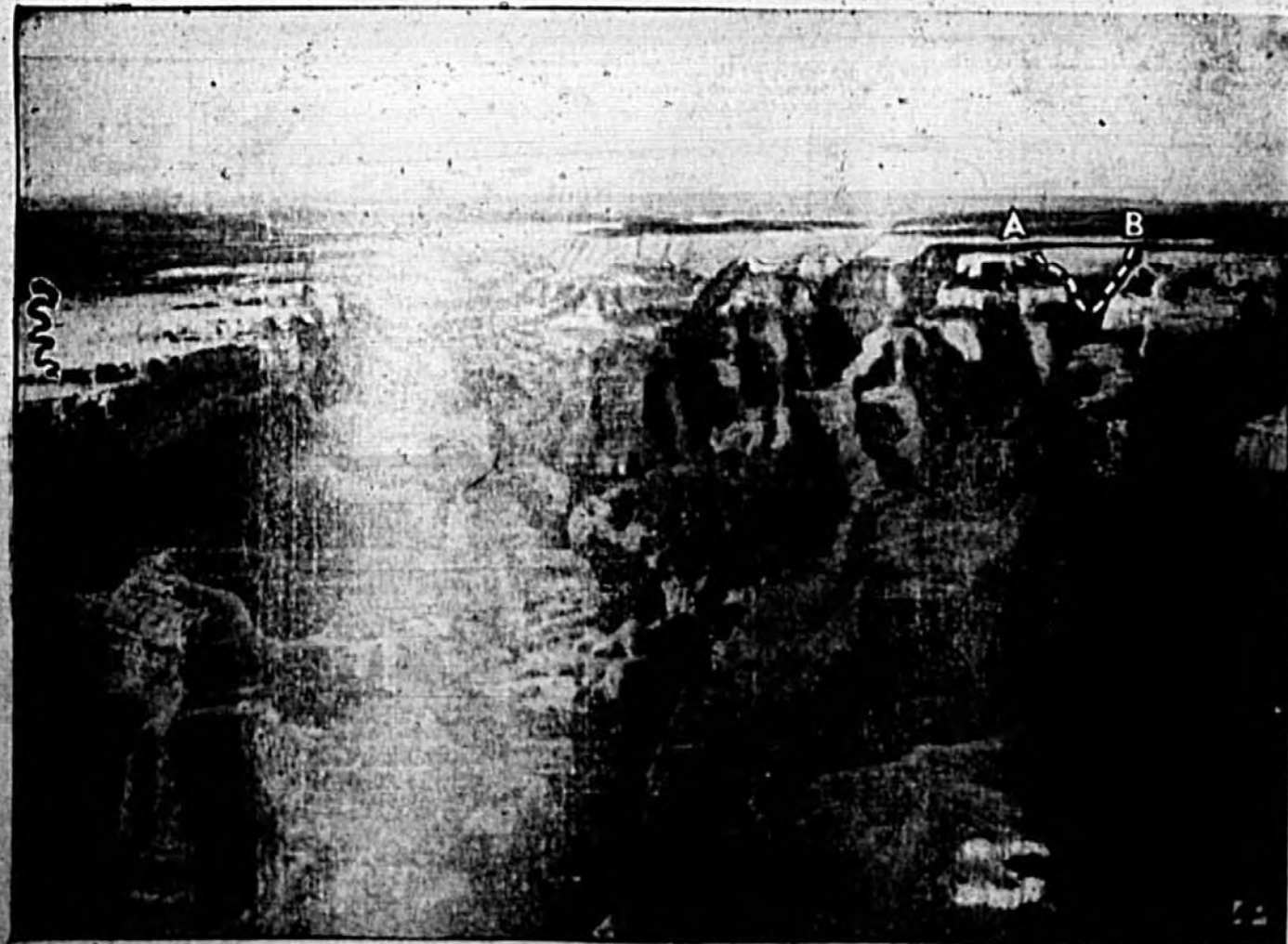
A LOST WORLD , isolated perhaps for thousands of years, will be explored by the Paterson Grand Canyon expedition, seeking any animal life that may be present atop Shiva Temple near the north rim of the vast gorge. In this photograph of a model of the canyon in the American Museum of Natural History, the sky-island goal of the expedition is indicated by A, and the base camp to be established on the north rim by B. The trail will follow a narrow strip of land that leads to the plateau. The canyon is a mile deep.