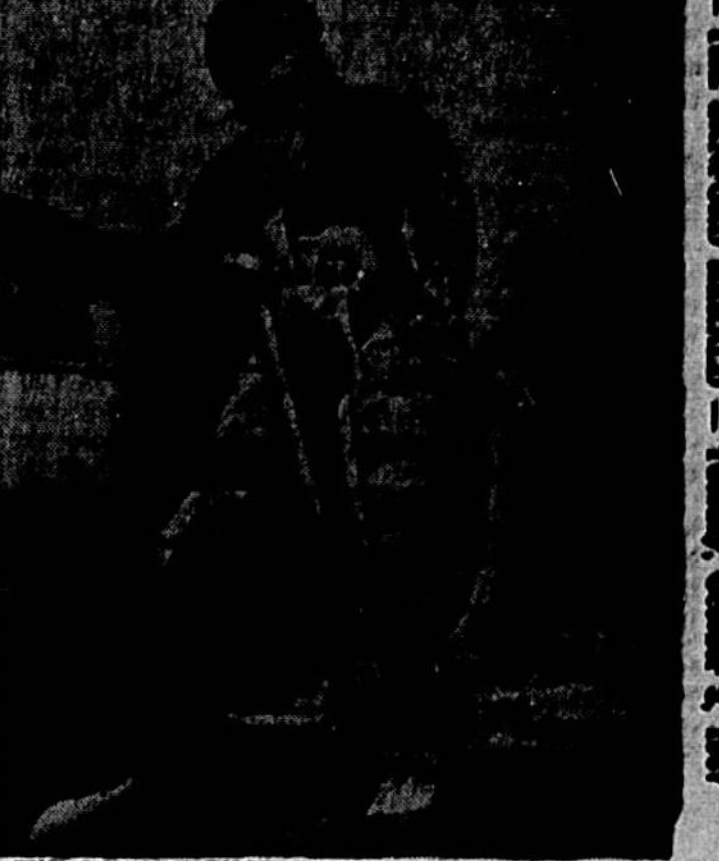
THE MACHINE THAT FOLLOWS EFFORTS IS BEST represented by the network. Will reveal that the students are the super heroes of the Space Age.

Other industrial giants are not on IBM's heels. Many teachers predict that in the school of the past, the distant future of the textbook will be nothing more than an unhappy memory. Students will receive almost 100 per cent of their information from computers.