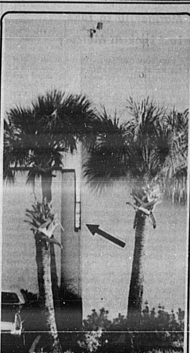
Narrow opening gives cellblock access. Smuggled Items Came 'Over Wall'