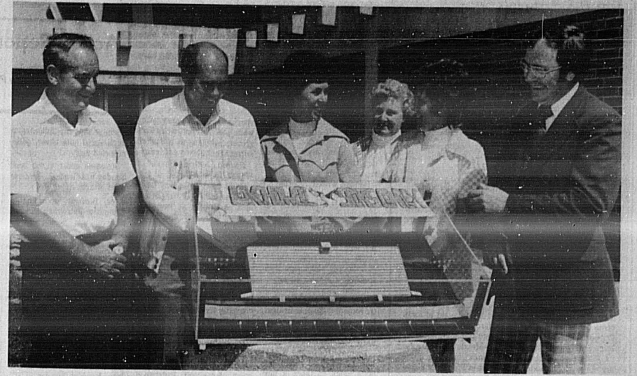
BOOSTERS TO BUILD STADIUM