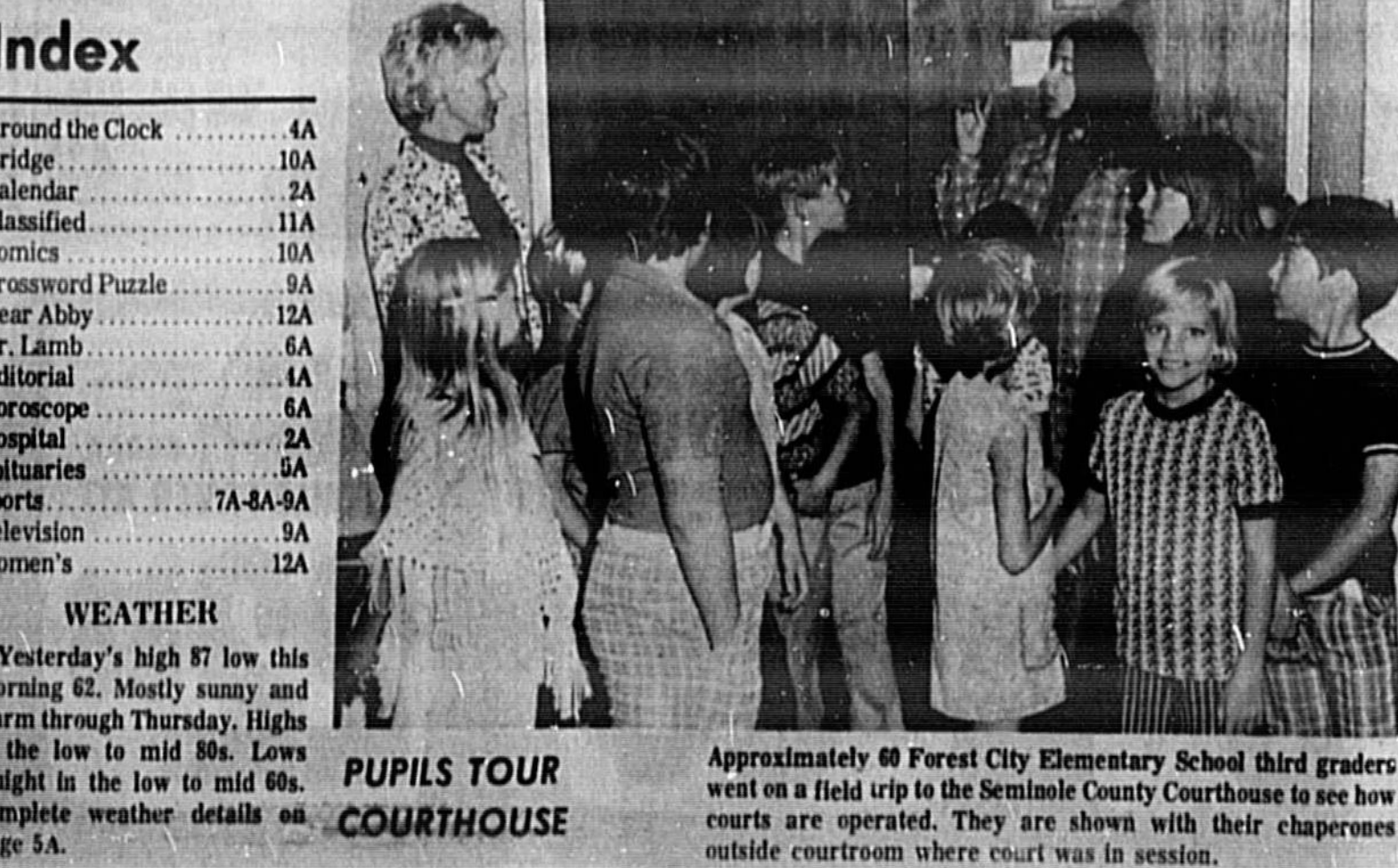
PUPILS TOUR COURTHOUSE. Approximately 60 Forest City Elementary School third graders went on a field trip to the Seminole County Courthouse...