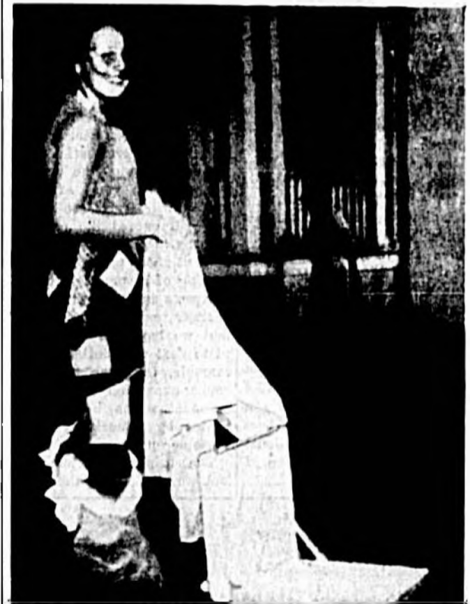
UNIDENTIFIED GUEST at Seminole County 4-H Rally Day pauses for a second to catch her breath as she tries her skill in the suitcase relay race. Some 75 4-H members and prospective members attended the event which was held at the County Agricultural Center.