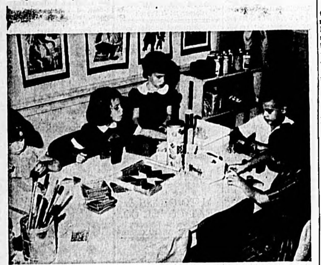
WHAT'S YOUR CHOICE? Paint's blocks, graphs, crayons, puzzles all have meaning to teachers, as pre-school first graders express themselves in various media. Pupils are unaware that their creations enable the teacher to judge their manual dexterity, correlation, group adjustment, and many other abstract qualities as she observes what they do with the materials put at their disposal.

Gruff and the Three Little Pigs, accompanying her story with figures and cutouts placed on a flannel graph board. (Flannel figures on a flannel board stick where placed). Very quickly the children learn to come up and tell the story using the figures themselves, as they relate, "and then what happened?" "This way we can spot problems, note adjustments needed by the child, areas in which