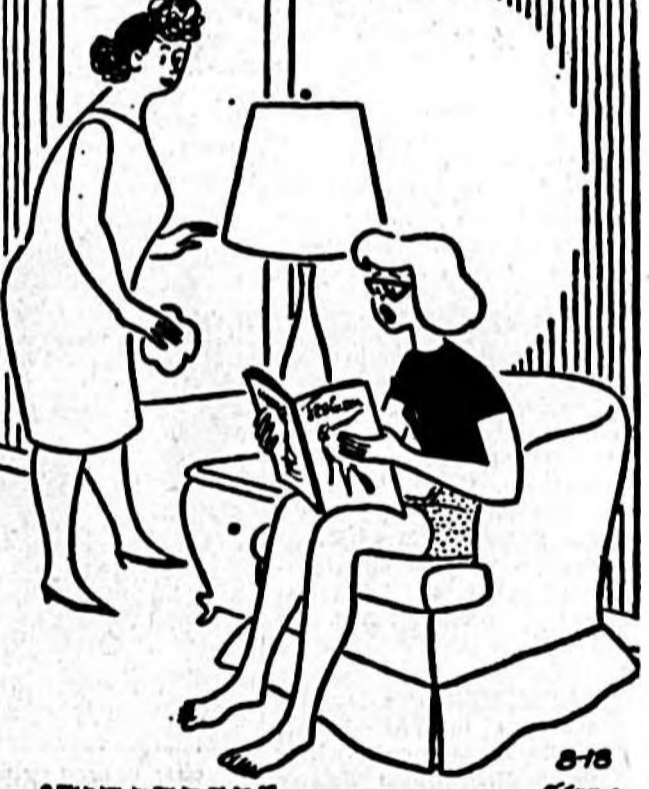
"From the look of the new fall fashions, all the designers must be mad at American womanhood!"