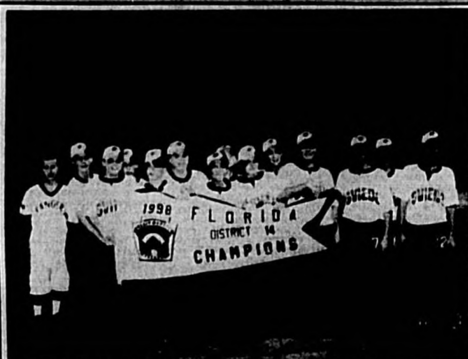
The Oviedo 11-12 Major Little League All-Stars won the District 14 championship last week. Players on the team were: