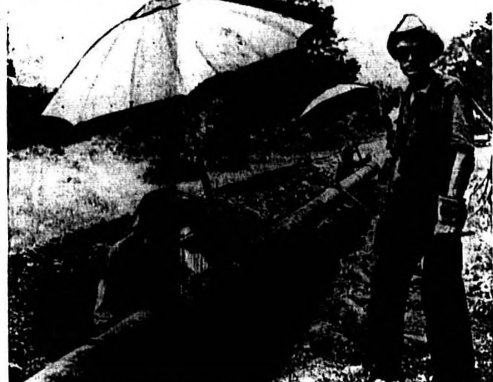
Because it is 99 in the shade of counting the heat from the sun, the worker is protected by the shade of a large tank. The worker is working on a piece of machinery at each end of the pipe. The pipe is 100 feet long and is being used to transport oil from the Gulf of Mexico to the Atlantic seaboard from the Gulf of Mexico.