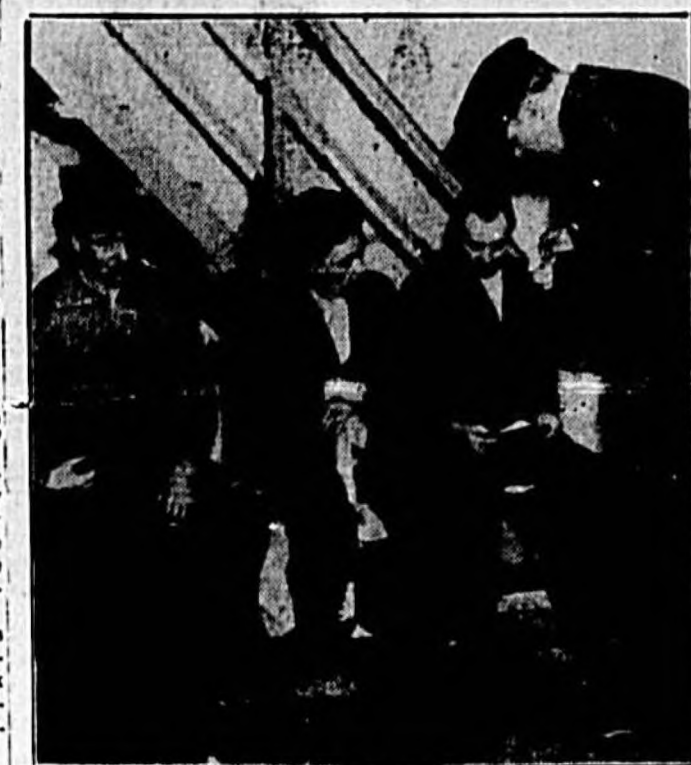
Voluntarily chaining themselves in the basement of an apartment house in the Bronx, New York, these building service workers started a sit-down strike which they hope will extend to buildings throughout Manhattan. A policeman is shown taking their names.