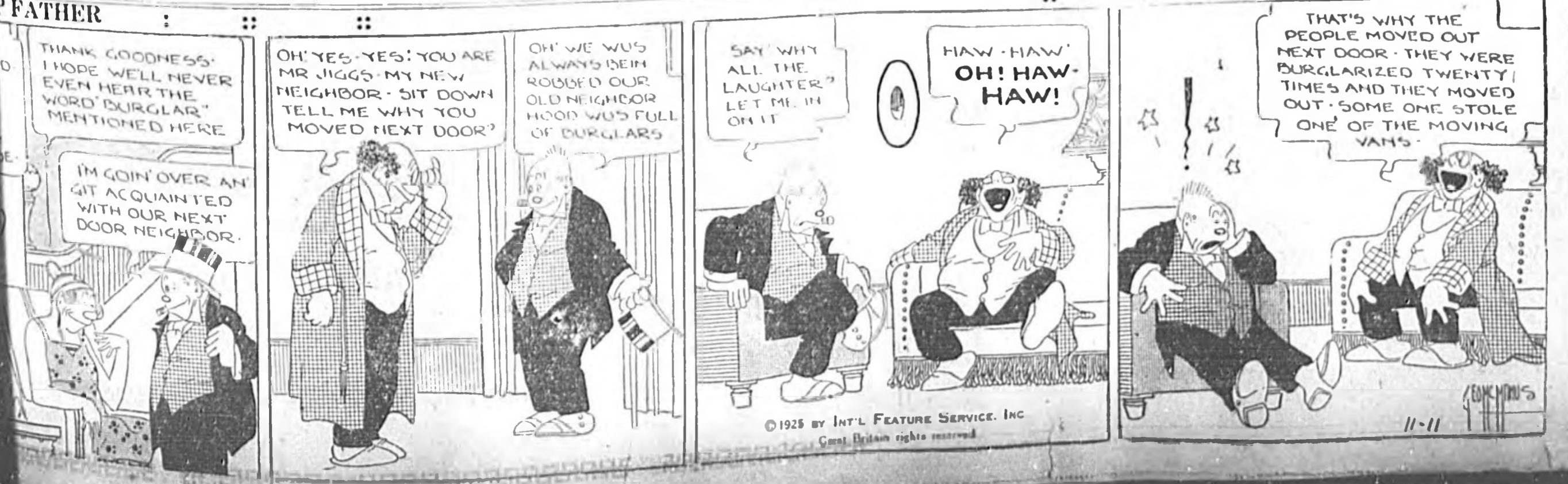
© 1925 BY INT'L FEATURE SERVICE, INC. Great Britain rights reserved.

BROWN Realty Co. 422 Union Ave. Telephone 473-w