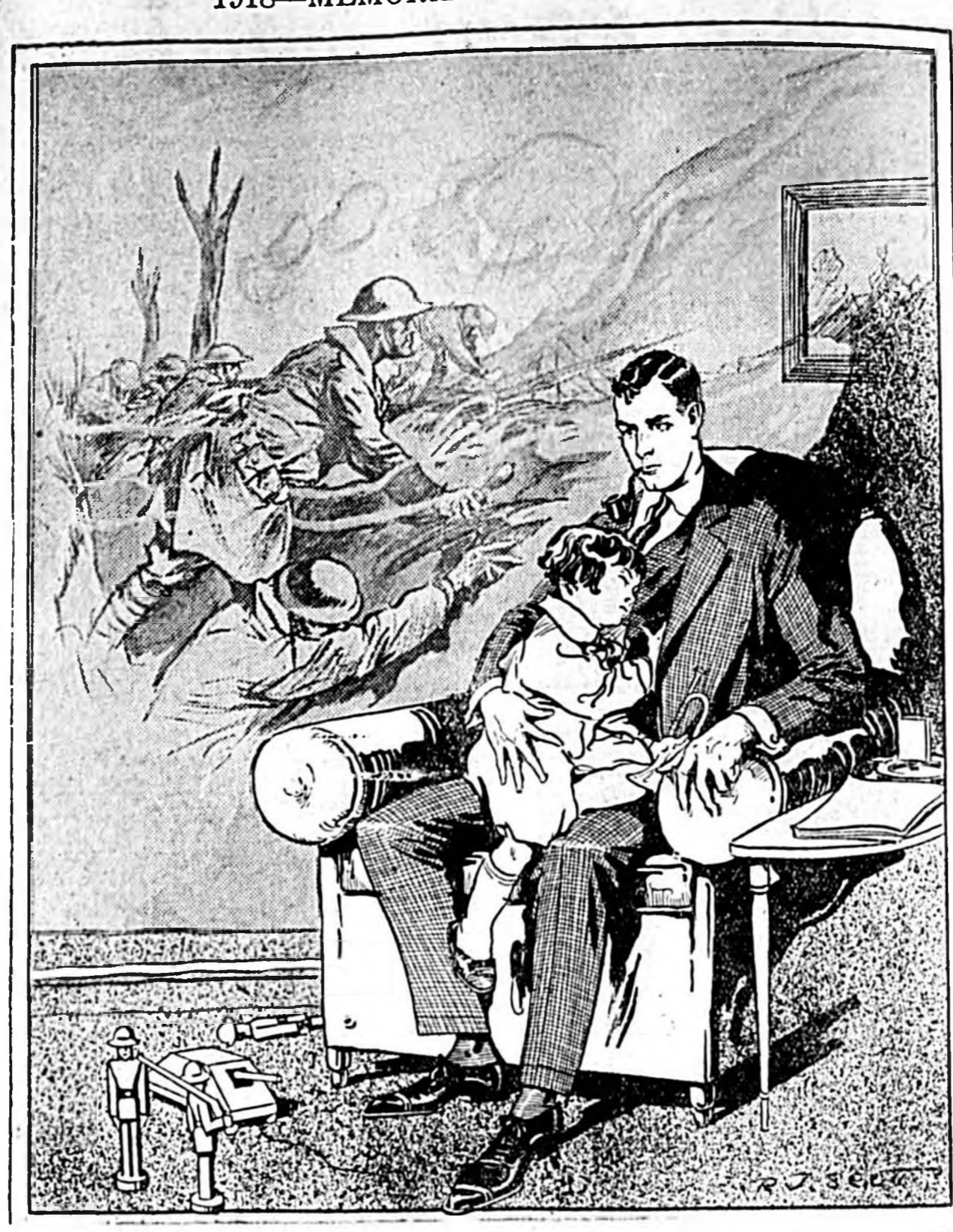
WEIGHED AND FOUND WANTING TRI-CITY NEWS

Decorate Your Armistice Day. Red, white and blue bunting. American and Allies Flags. Red, white and blue, festoon.