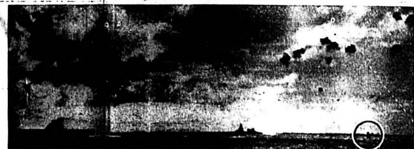
A Japanese dive-bomber (circled) is shown as it hit the water after being shot down by a U.S. Navy carrier battle group in the South Pacific. This is a photograph.