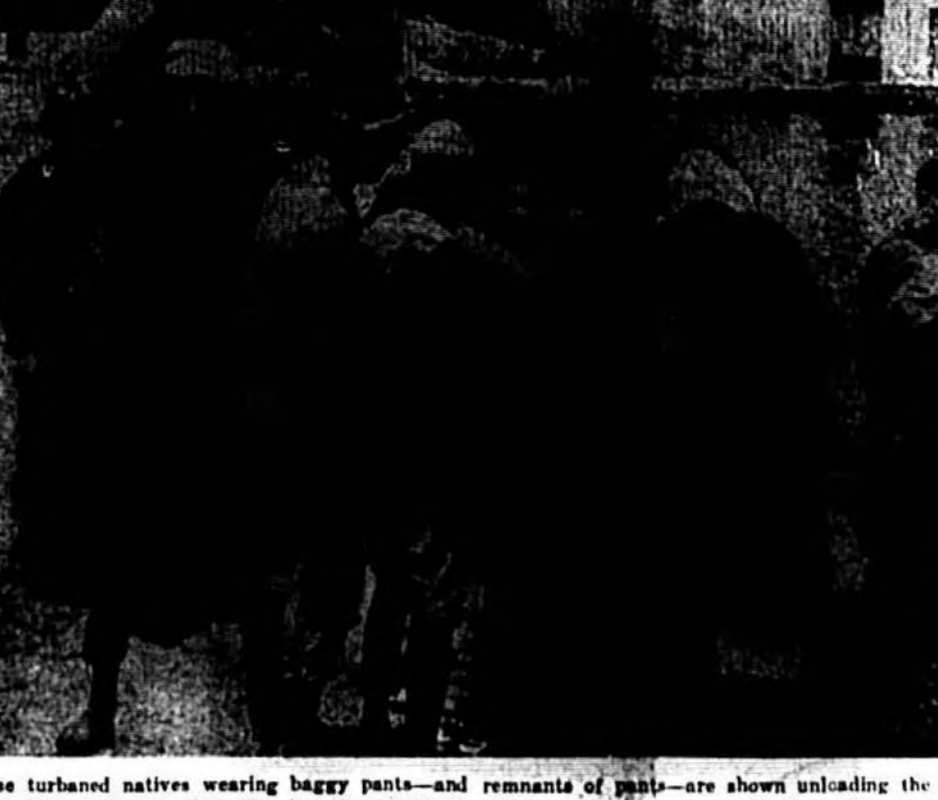
These tubed natives wearing baggy pants—and remnants of head—were shown unloading the equipment of the American Expeditionary Force in North Africa. The natives were hired on the spot.