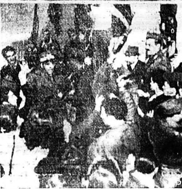
ROME POLICE ESCORT a monarchist step to jail following a riot as the new Republic struggled to life. In another section of the city, police moved into a group of the monarchists to break up a demonstration. Royalist followers rioted throughout Italy.