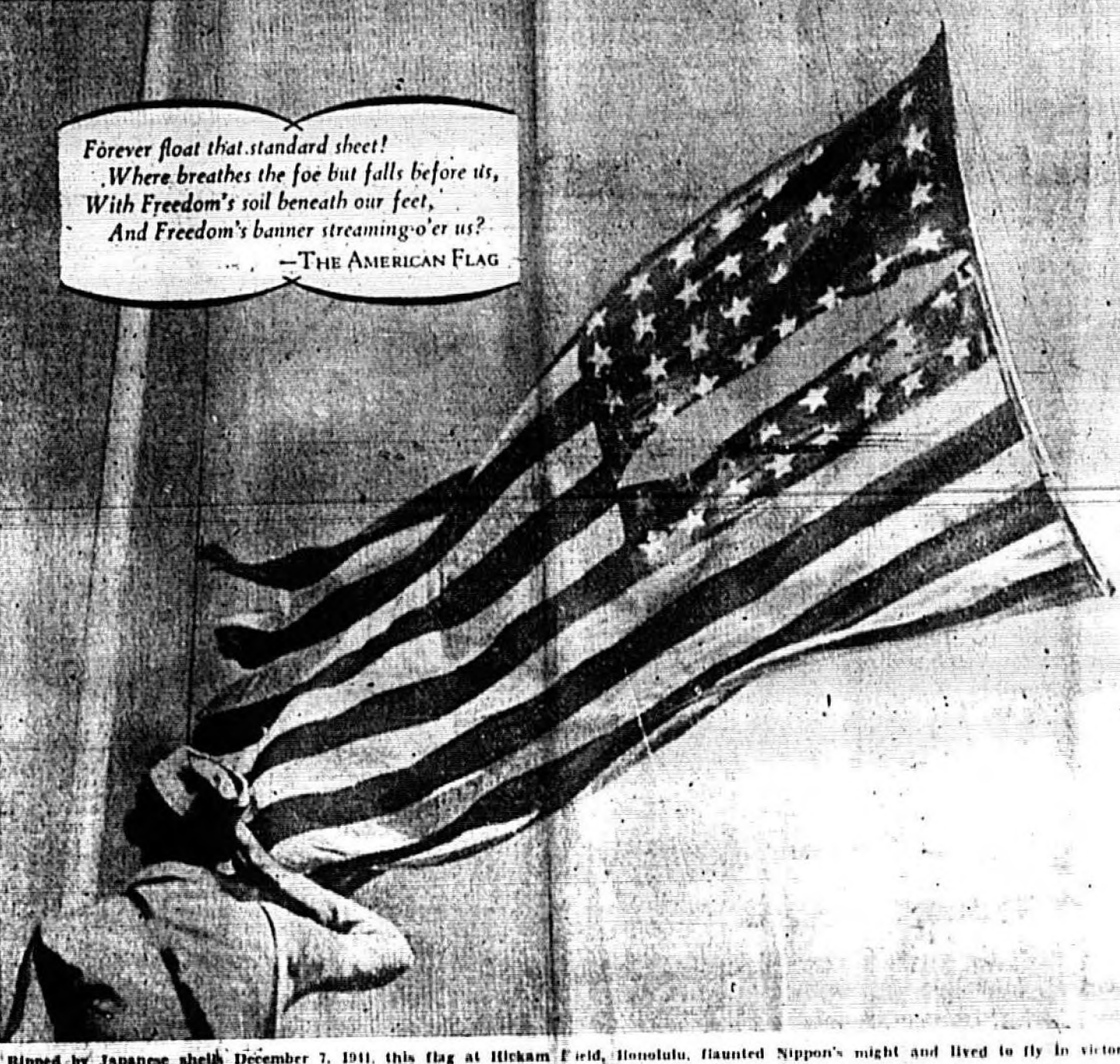
Shipped by Japanese ship December 7, 1941, this flag at Hickam Field, Honolulu, flouted Japan's might and lived to fly in victory.