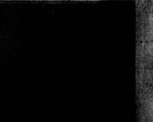
A man is shown here in a recent photograph, possibly related to the conviction mentioned in the headline.