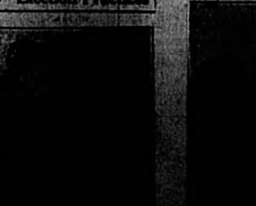
A man is shown here in a recent photograph, possibly related to the Louisiana election practices.