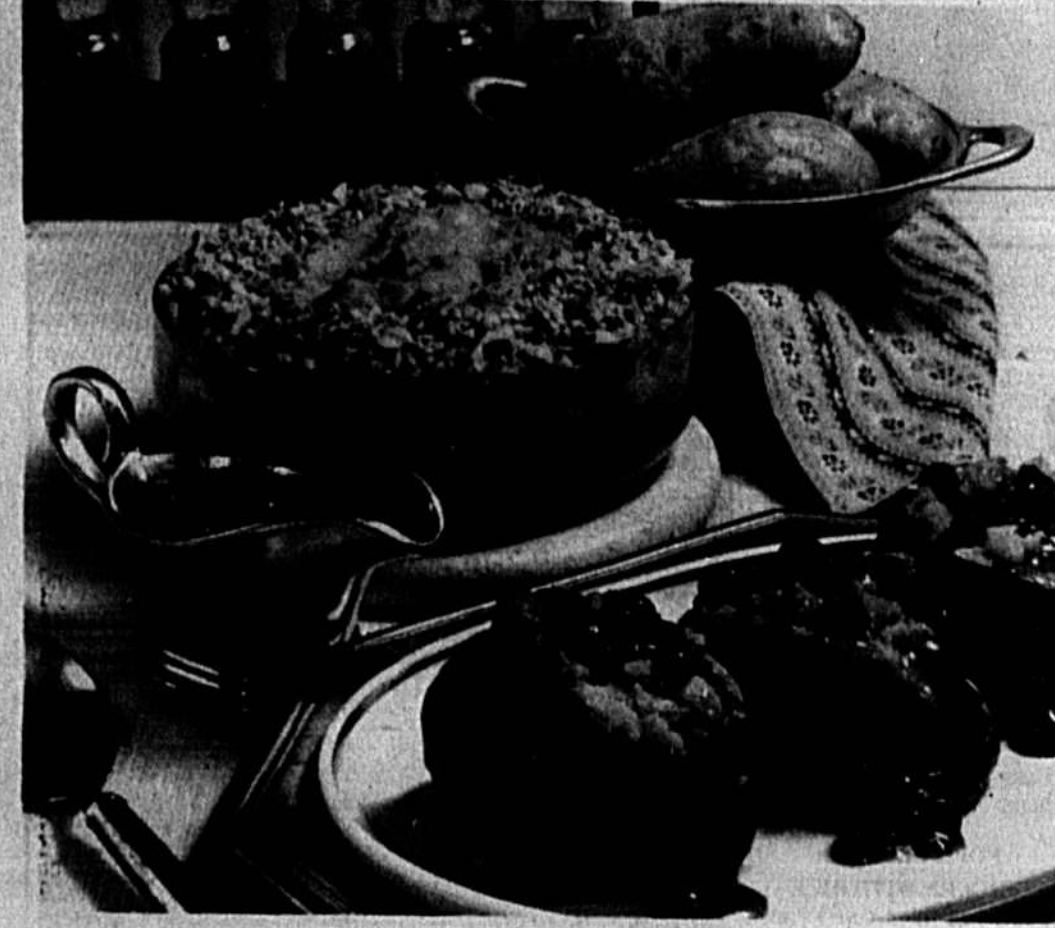
CRANBERRY STUDED YAMS