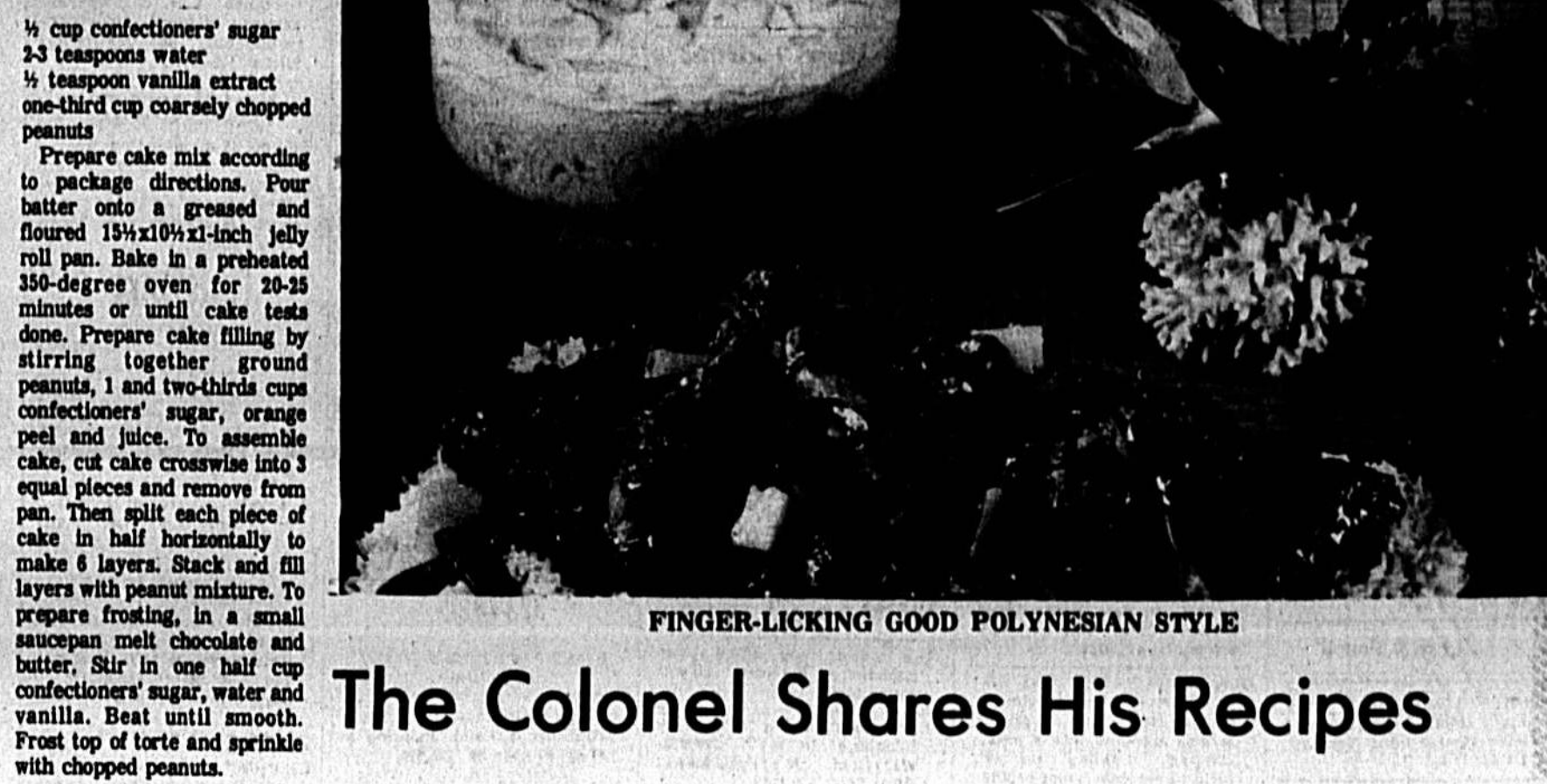
FINGER-LICKING GOOD POLYNESIAN STYLE The Colonel Shares His Recipes