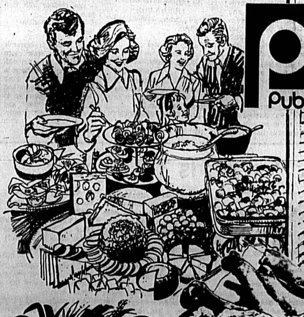
POTATO CHEESE LOAF

Many bread recipes were handed down from pioneer days when settlers couldn't hop into a gas-station and drive to the nearest bakery. Baking was done at home and done very well, thank you.