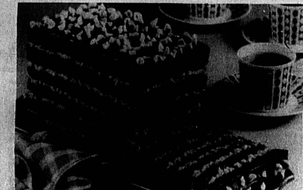
A DEVIL OF A PEANUT TORTE

By AILEEN CLAIRE Herald Staff Writer It's time to round up your baking equipment as the holidays move into full swing. Even the regular cook who enjoys baking throughout the year moves into full gear during winter, no matter the region. A peanut torte which starts with a packaged food mix may be the solution for the working mother or the relatively new baker. Make ahead and serve with ice cream. PEANUT TORTE 1 package (1 pound 2.5 ounce) Devil's food cake mix 3 cups ground peanuts 1 — two-thirds cups confectioners' sugar ¼ cup grated orange peel ¼ cup orange juice 1 square (1 ounce) unsweetened chocolate 2 tablespoons butter