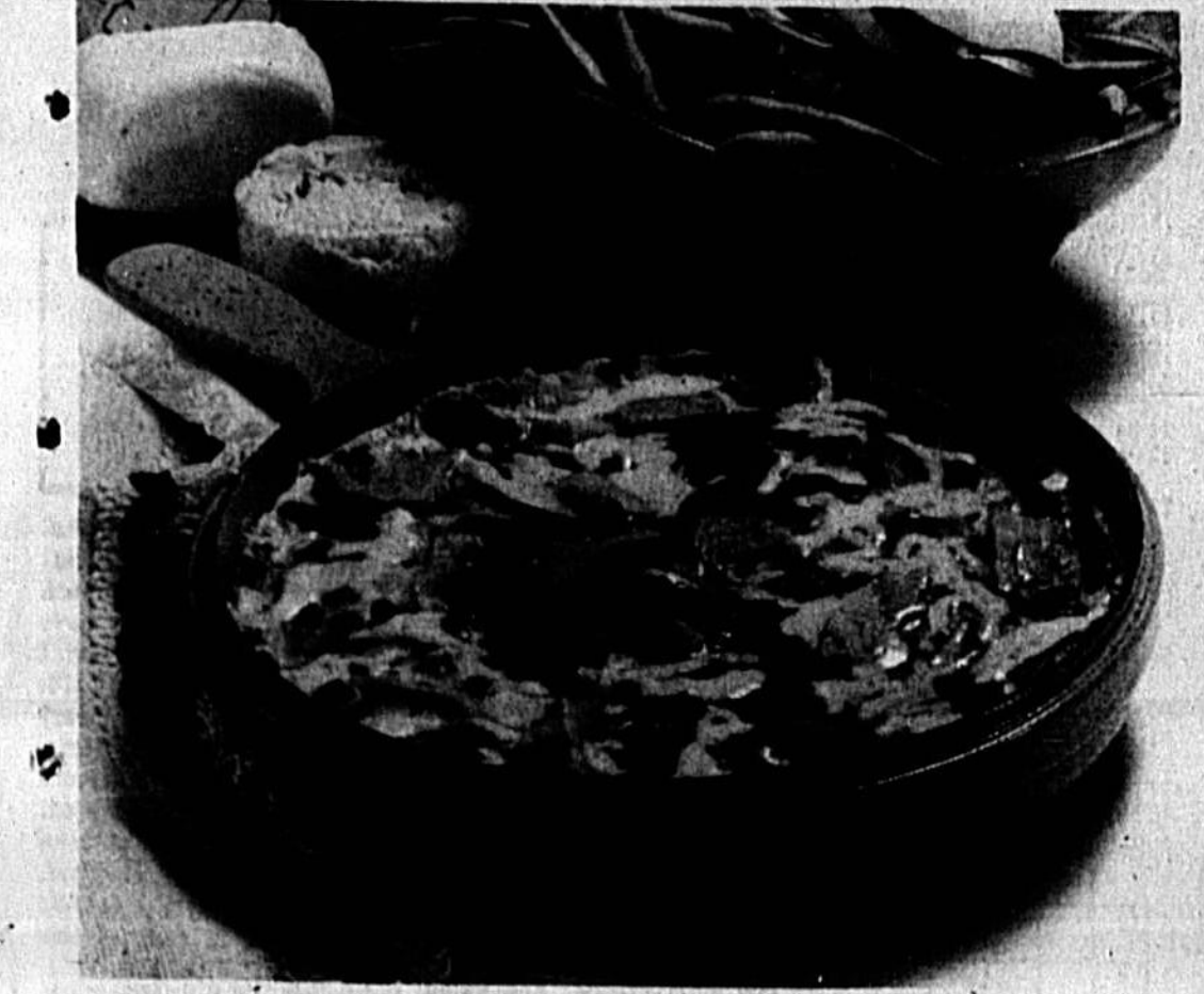
TUNA FRITTATA - CREATIVE ITALIAN COOKERY