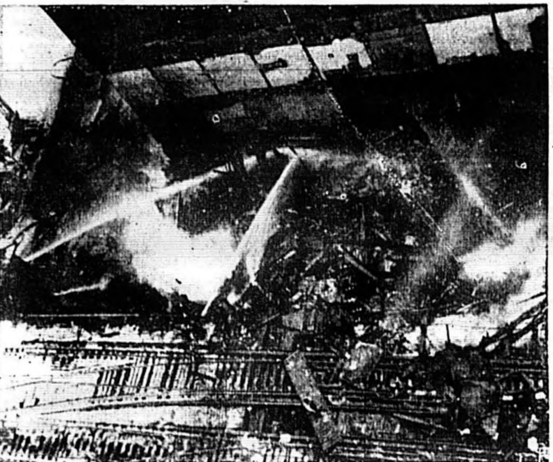
INDICATING THE TERRIFIC force of the explosion, which wrecked a three-story building on the southwest edge of Chicago's Loop, are the huge slabs of concrete sidewalk to be noted on the ground which were hurled about eleven blocks away from the scene. At least three persons are reported to have been killed and two others were injured in the explosion. Buildings for the past several years had been erected on the site.