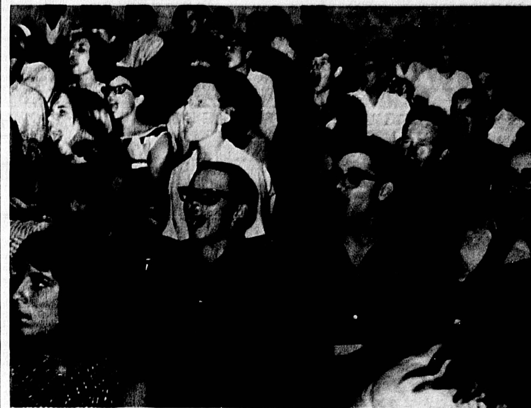
Go, Seminoles! Beat Titusville!

The Sanford Herald Sept. 16, 1966 — Page 1A