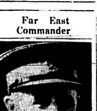
Far East Commander Archibald P. Wavell, British commander for India and Burma and the first military leader to score a smashing success against the Axis in Libya, is slated to head the anti-Axis land, sea, and air forces in the Far East.

COURT DOORS CLOSED WASHINGTON, Jan. 6.—(AP)—The doors of the Supreme Court were closed today.