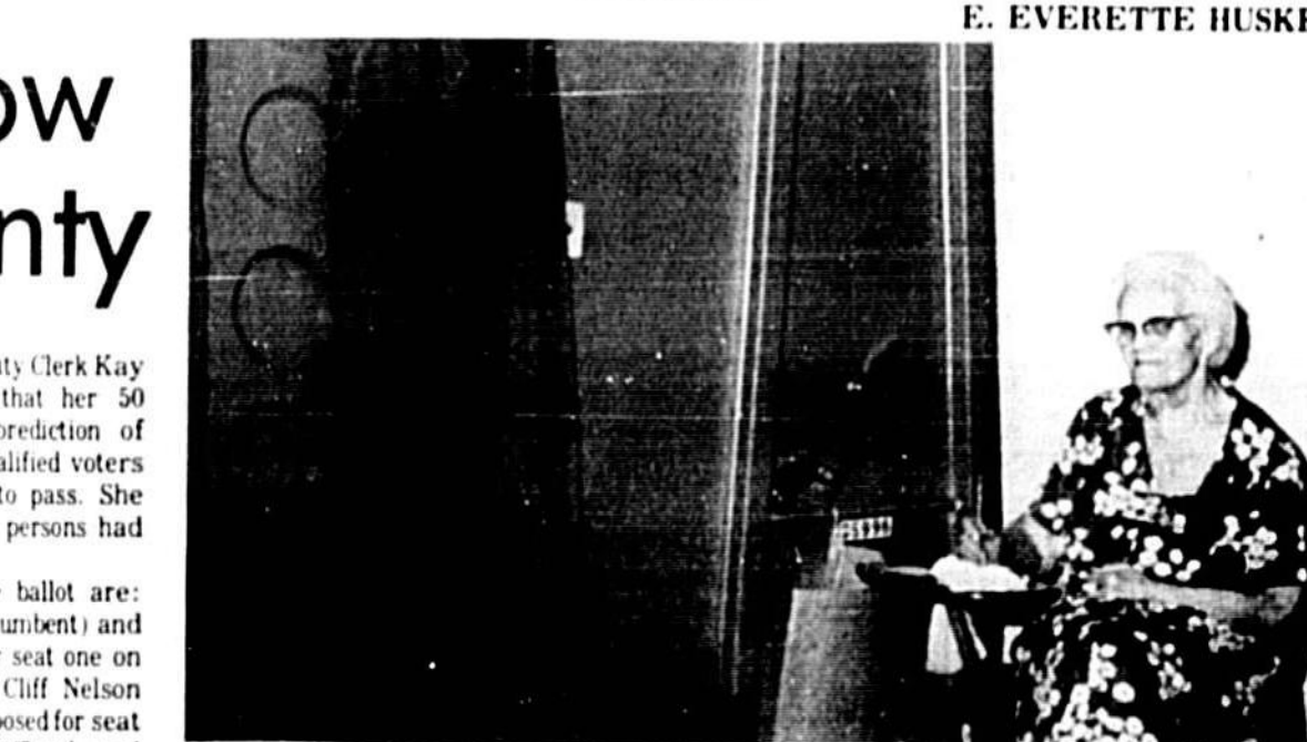
ARLENE AUSTIN AT LONGWOOD POLLING BOOTH