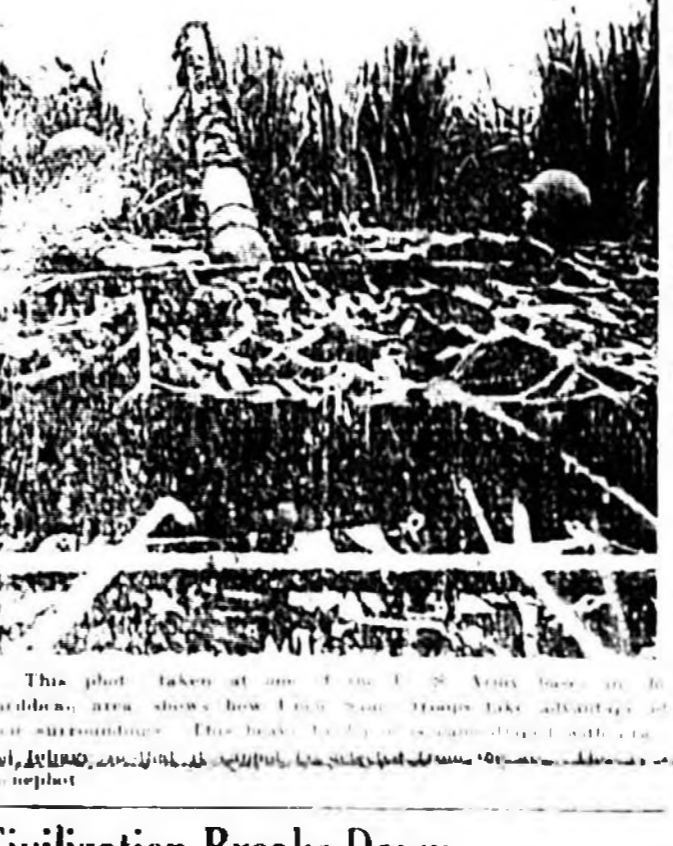
This photo taken at one of the U. S. Army bases in the Carolinean area shows how the Army has taken advantage of the terrain to hide its big guns.