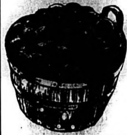
TABLE SUPPLY FRESH FRUITS & VEGETABLES!

TABLE SUPPLY ENRICHED White Bread 8c Cello Puffed Wheat pks 5c Prince Albert Tobacco can 10c