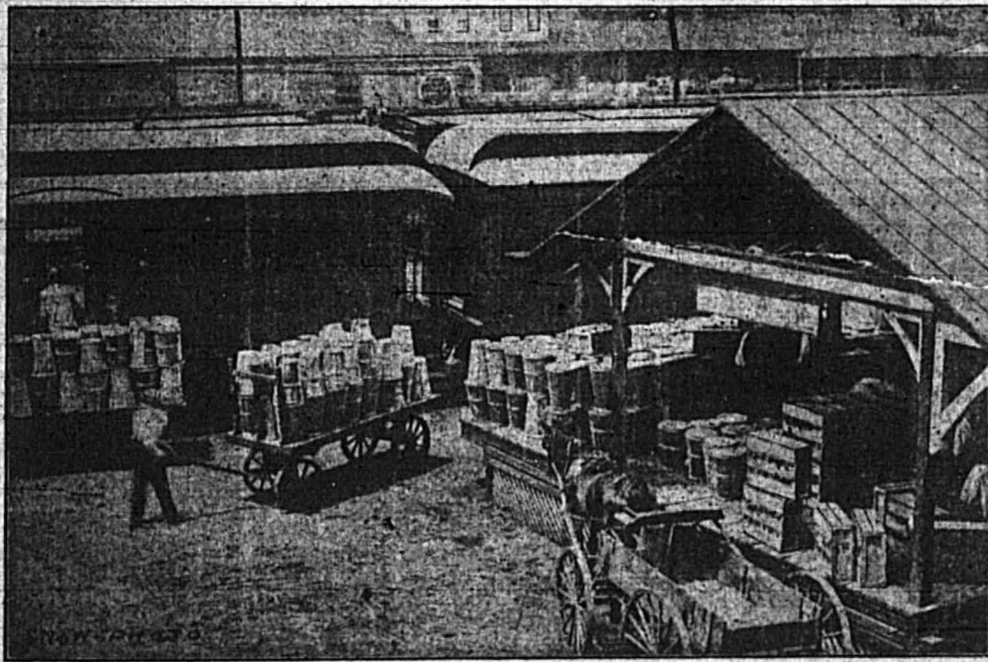
LOADING CELERY AND LETTUCE AT THE A. C. L. TERMINAL

The reasons why you should locate in Sanford are many but the most important are outlined below. If you need any further information write to the Secretary of the Sanford Commercial Club or the Sanford Herald.