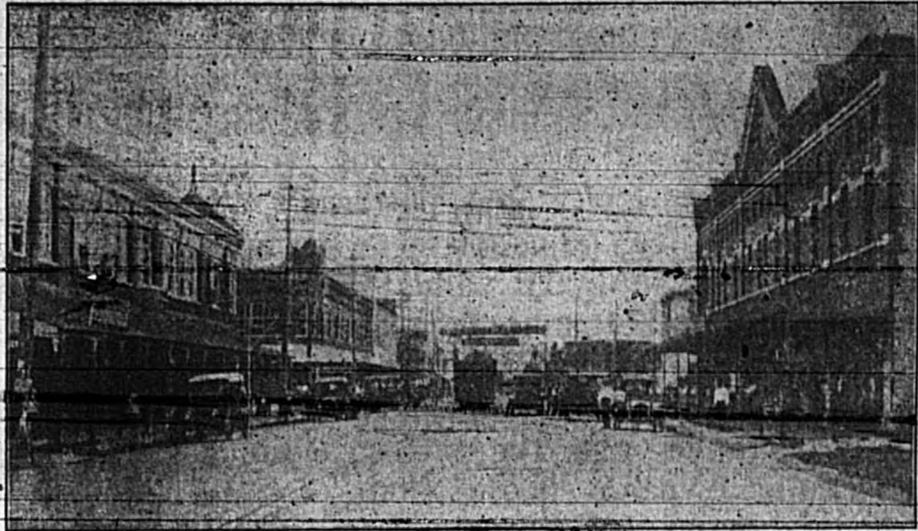
SCENE OF FIRST STREET LOOKING EAST SHOWING STREET CAR

With over 5,000 people in the city limits there are at least 2,000 more within two miles of the city limits and at least 3,000 within the Celery Delta—a population that is a part of Sanford and from which the city derives a revenue.