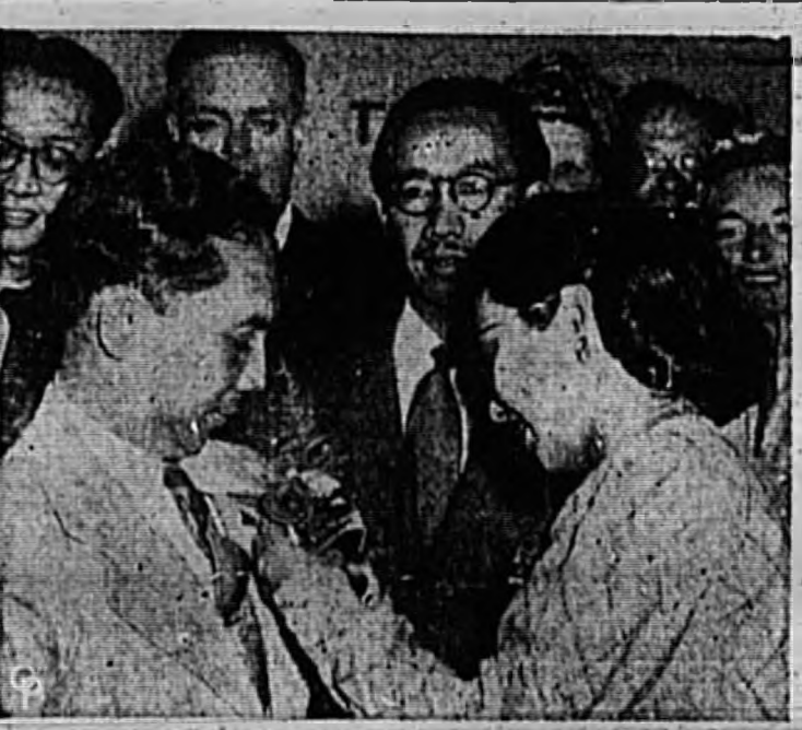
FORMER PREMIER of the Indonesian Republic and now adviser to the president of the republic, Sutan Sjahrir is decorated with a flower on his arrival at La Guardia Field, N. Y., from Cairo, Egypt. He said the purpose in visiting the United States was "to see and hear." Sjahrir declined to discuss the part that the United Nations might play in settling the conflict between the Dutch and Indonesians.