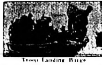
Group Landing Barge