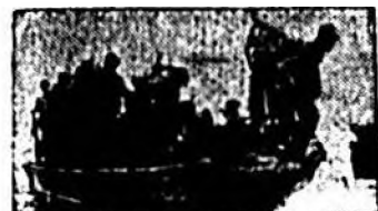
Troop Landing Barge

Established in 1908 SANFORD, FLORIDA, TUESDAY, FEBRUARY 16, 1943. Member Associated Press NUMBER 123.