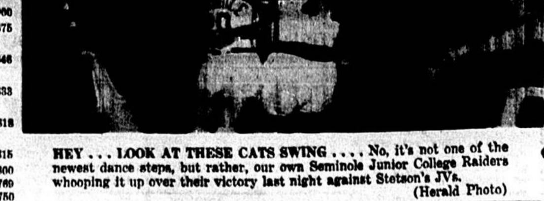
HEY... LOOK AT THESE CATS SWING... No, it's not one of the newest dance steps, but rather, our own Seminole Junior College Raiders whooping it up over their victory last night against Stetson's J.V.