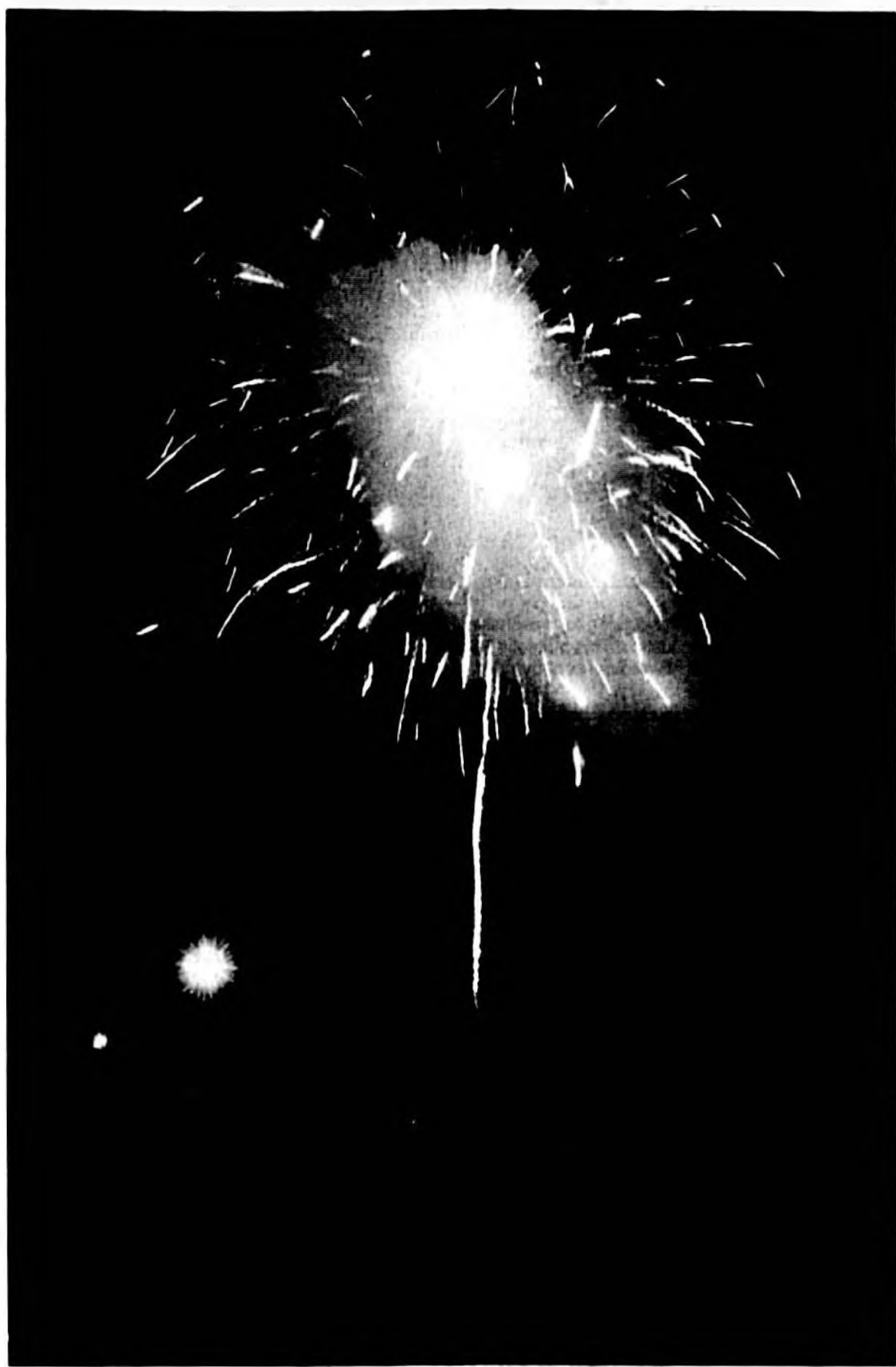
Fireworks explode over the Monroe Harbour building during Monday night's 23-minute pyrotechnics show presented by Zambelli Internationale.