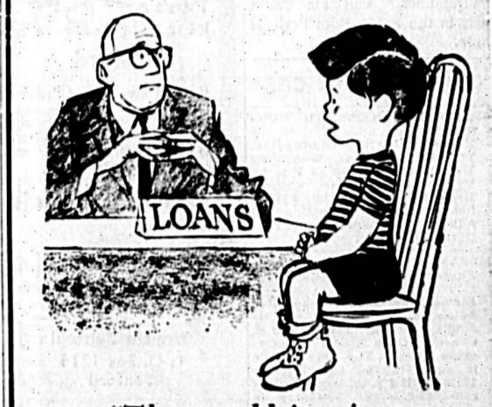
"They wouldn't raise my allowance, so here I am."