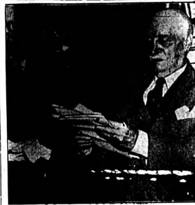
Stricken with sudden illness, Senator Duncan U. Fletcher of Florida dropped dead at his home in Washington, D. C. He is shown reading congratulatory messages on his 77th birthday anniversary.