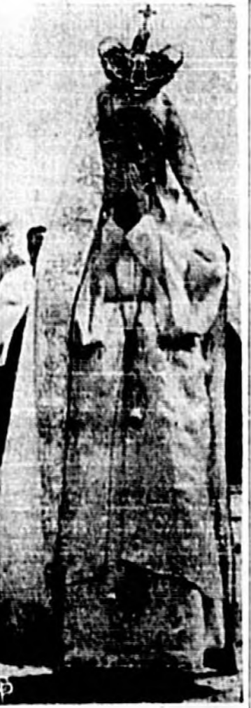
DRESSED like the shrine statue of Our Lady of Fatima, a Portuguese girl leads the procession at the annual celebration of the 1917 apparition. A record attendance of more than a half million pilgrims from all over the world came to Fatima for the observance. (International)