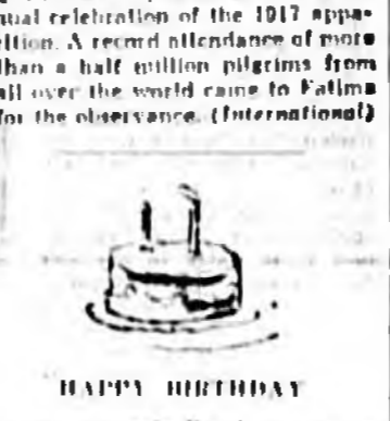
HAPPY BIRTHDAY Music Played

CREAMED scallops are delicious, and easy to prepare. Simmer the scallops in a little water until done; use the liquid in which the scallops were cooked along with milk in a cream sauce. Heat the scallops and sauce together, season well, and serve on toast with a sprinkling of paprika and finely minced parsley.