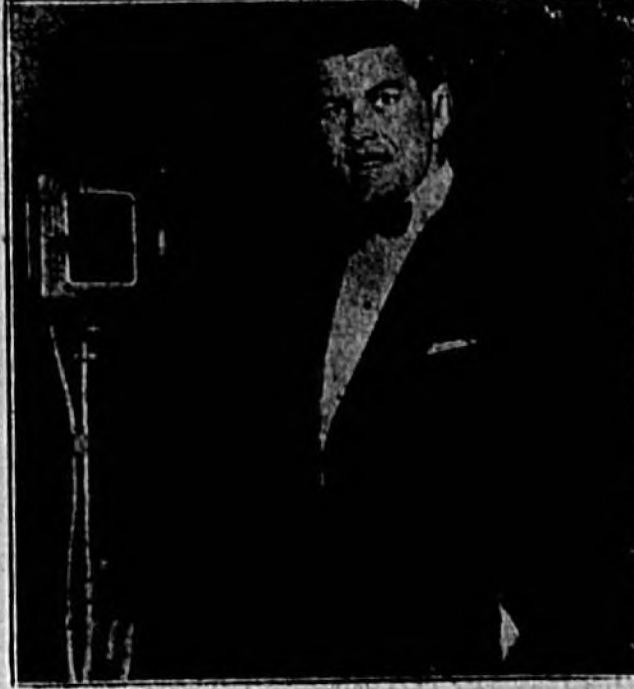
Here you see Gene Tunney, former heavyweight title holder, as he appeared before the microphone in New York in his first broadcast since returning from Europe...