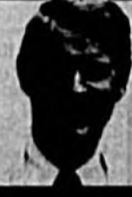
PETER GOTT, M.D.

These two factors can cause the appearance of bags under the eyes. You may be relieved to learn that many plastic surgeons are quite adept at removing excess tissue around the eyes. If you are tired of looking like the Ghost of Christmas Past, see a plastic surgeon for an opinion.