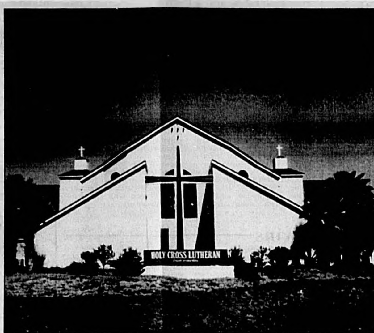
Holy Cross Lutheran Church 760 Sun Dr., Lake Mary, FL.