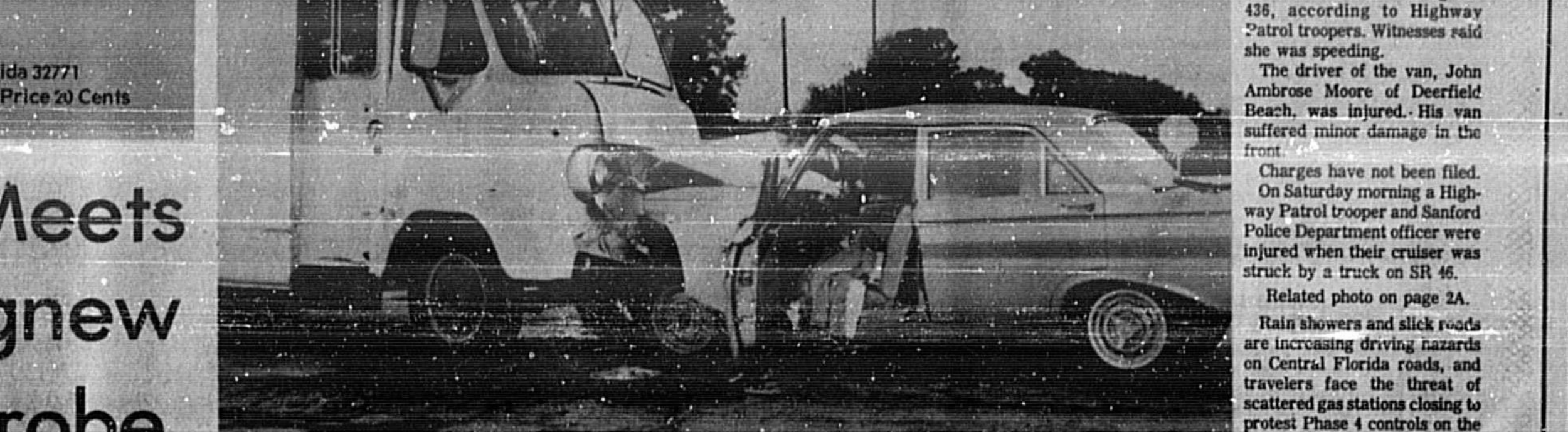
GIRL DIES IN HEAD-ON COLLISION... Car was airborne as it struck van