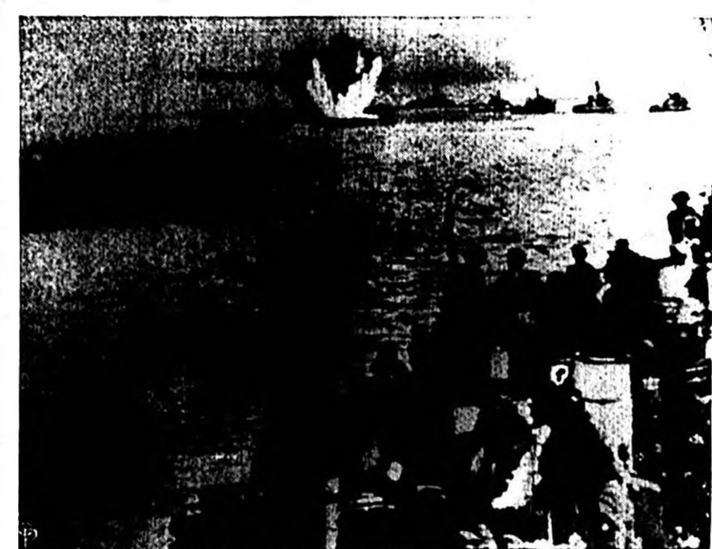
AN AXIS ROCKET HOMB that missed the mark exploded behind the lines of the 3d Marine Division on the beach of the Salerno peninsula, Sept. 16, 1943.

Yanks Push On To Italy Under Enemy Bombs