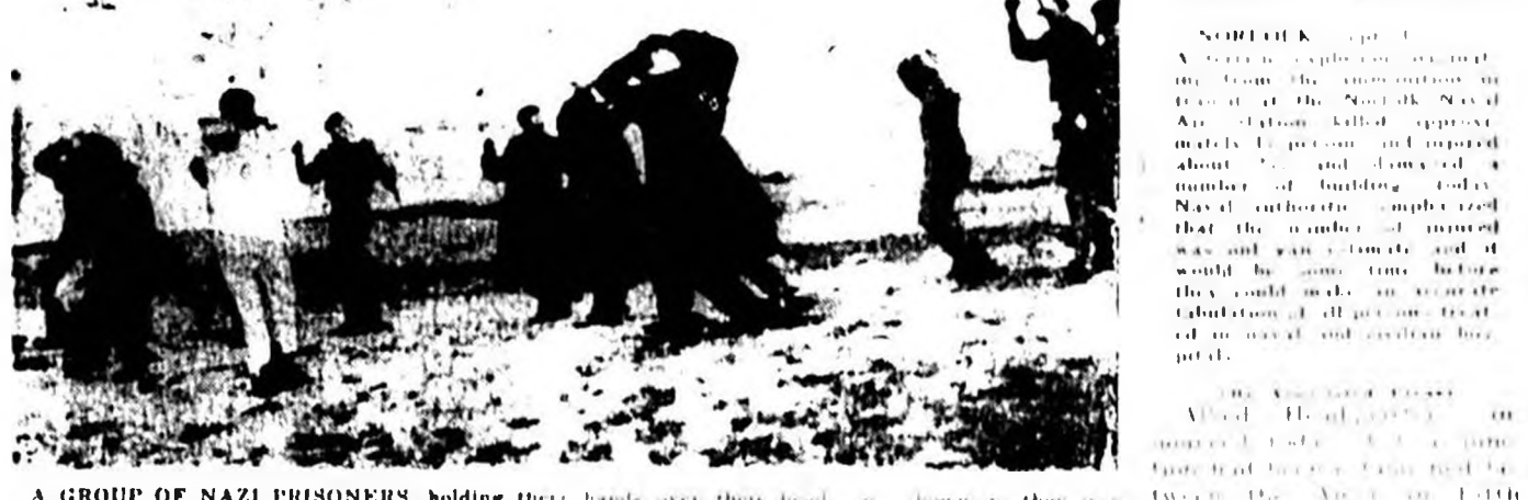
A GROUP OF NAZI PRISONERS, holding their hands over their heads, are shown as they are rounded up on a beach in the Salerno area by attack units of the U.S. Army. The prisoners are being taken to a camp near the front lines.

German Position At Salerno Grows Precarious As Allies Secure Beachhead