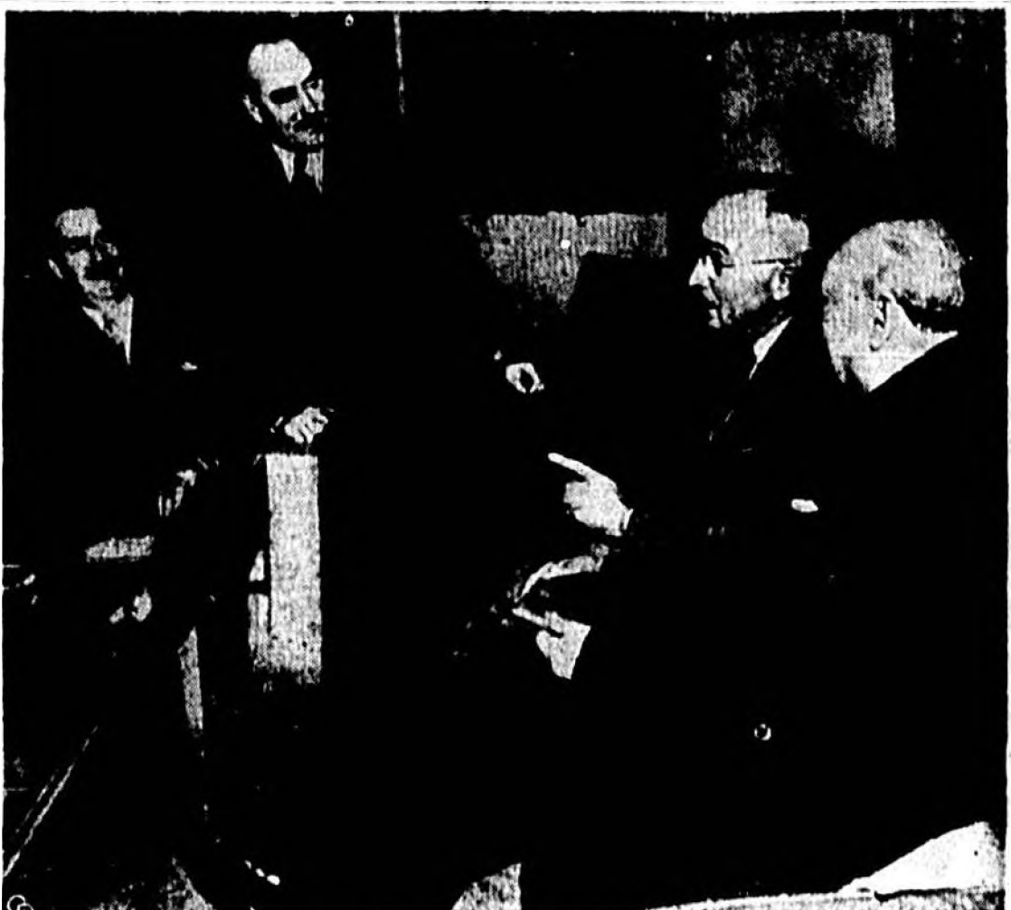
In a relatively light mood before vital world issues were considered, President Truman uses an index finger to make a point as the four leading figures in the historic conference sit together for the first time on the White House yacht "Williamsburg."