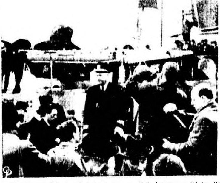
Commander W. E. Thompson, of the U.S. Destroyer "John W. Weeks," is congratulated by new members and photographers as he reaches Plymouth, England after a six-day voyage to the crowded destroyer.

WASHINGTON (AP)—Sen. Bridges of New Hampshire was elected floor leader for Republican senators today by a 76 to 15 vote.