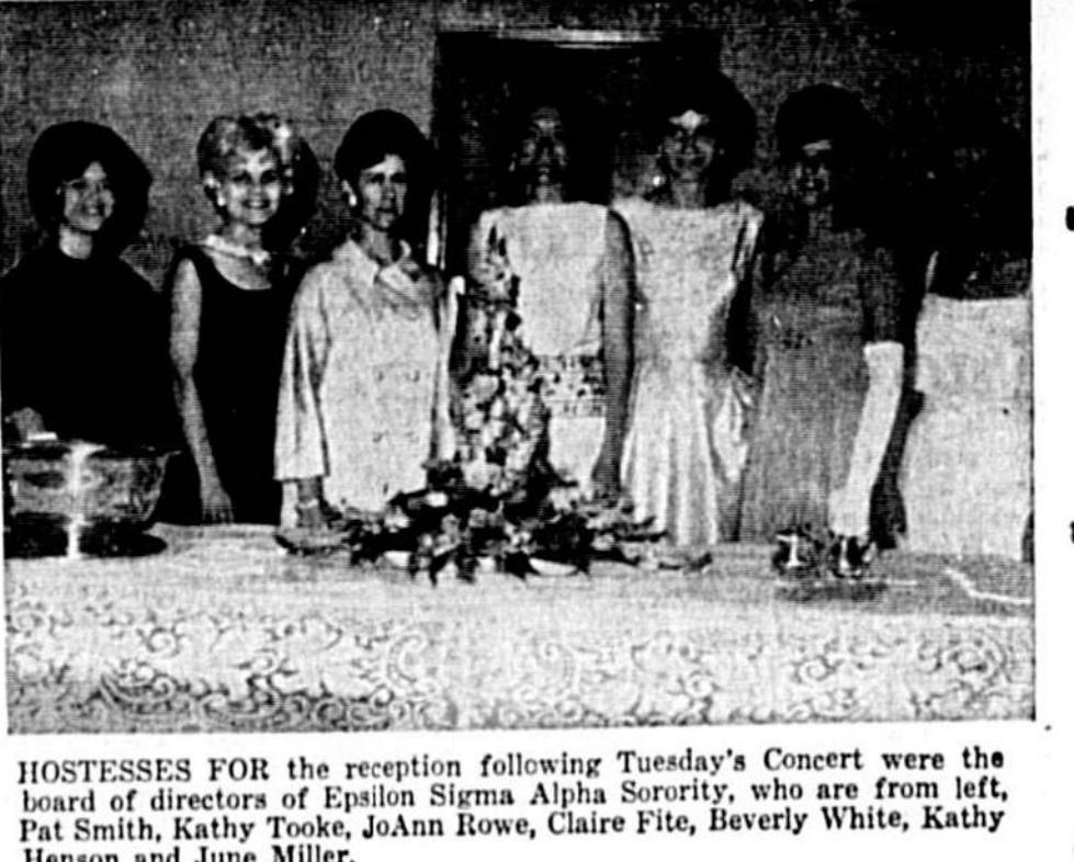
HOSTESSES FOR the reception following Tuesday's concert were the board of directors of Epiphany Sigma Alpha Sorority...