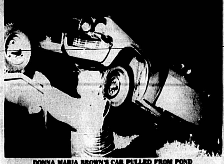
DONNA MARIA BROWN'S CAR PULLED FROM POND