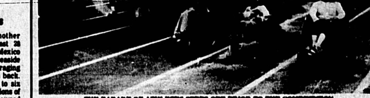
THE PARADE OF ATHLETES STEPS OFF PRIOR TO THE COMPETITION