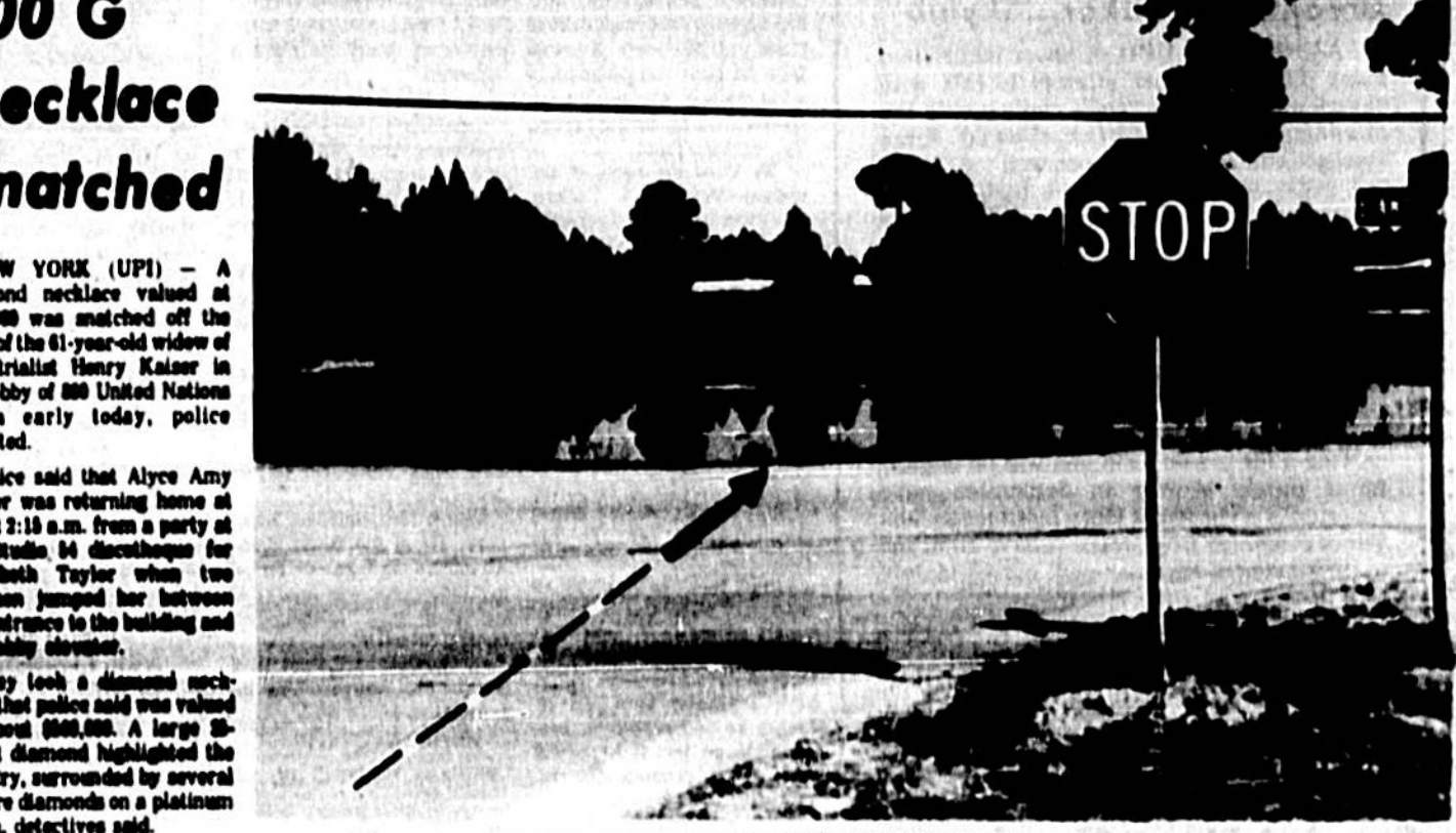
PATH OF CAR'S TRAVEL INTO POND WHERE GIRL WAS KILLED