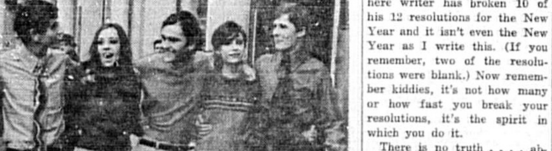
SKITTED GROUP in Munich, Germany draws second glances and mixed reactions when outlines their theory that the rise of the Roman Empire look for men harkening back to the days of shorts and laced footwear?