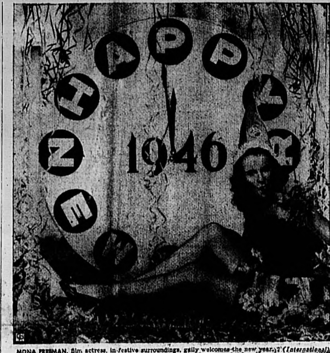
MONA FREEMAN, film actress, in festive surroundings, gaily welcomes the new year.