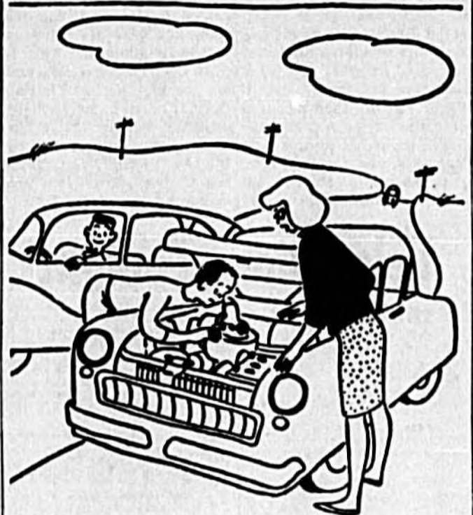
"Herb, may I have my dollar back that you borrowed to buy gas? Prentiss and I need it to buy gas."