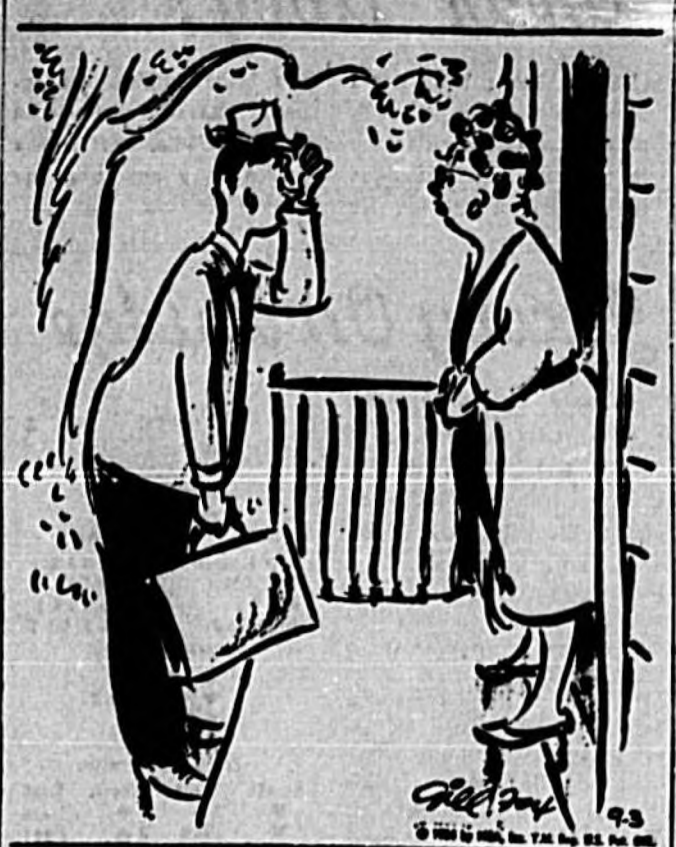
"Good morning, Madam! Has anyone ever told you you look like Zsa Zsa Gabor?"