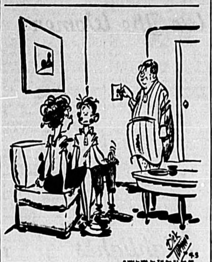
"But, Daddy, we're only following the White House example in turning out lights that aren't needed!"