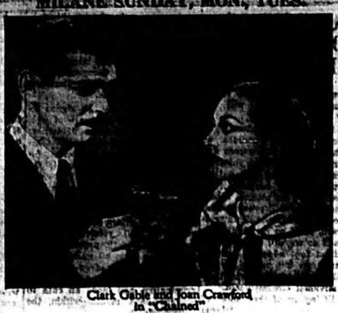
Clark Gable and Joan Crawford in "Chained"