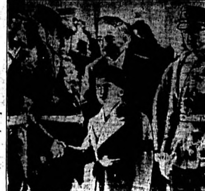
Photo shows King Peter II (center), the boy monarch of Yugoslavia, as he arrived in Belgrade to ascend the throne left vacant when assassin bullets killed his father, King Alexander, at Marseille, France, Prince Paul, a member of the regency that will rule the country until the 17-year-old king comes of age, is shown at the right. The others are generals of the army greeting Peter who was in school in England when tragic fate exiled him to swap his student's cap for a crown. The picture was telephoned from Belgrade to London and cabled to the United States by the Bartane Transmitting System.