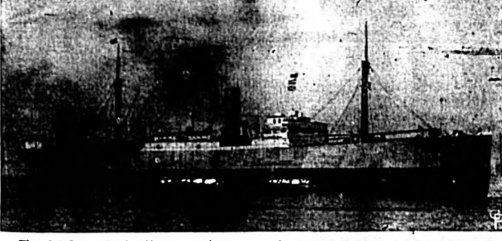
The 5,687-ton Steel Mariner (above) to be sent to the bottom since start of the European war. All members of the crew were saved. The ship was carrying supplies to British in the Middle East.