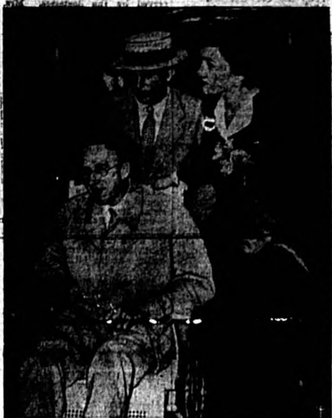
Professor Philip Jessup, of Columbia University, one of the five survivors of an air crash near Sao Paulo, Brazil, in which eight died, arrives at New York aboard the Brazil. He is accompanied by his wife. Prof. Jessup was awarded Brazil's highest decoration for his heroism in aiding victims.

Council of the Department of Agriculture to arrange one of its weekly radio programs for a discussion of margarine. One of the characters on the program said: "Many people are finding out they can save quite a bit of money by using margarine instead of butter. It's quite a lot cheaper." "Both butter and margarine are chiefly fat. By law or government rules, both must be at least 80 percent fat. Butter is made from the fat from cream. And margarine, according to new standards just set up, can be made from animal fat or oil, or vegetable fat or oil, or a combination." "There's little to choose between the various kinds of pure