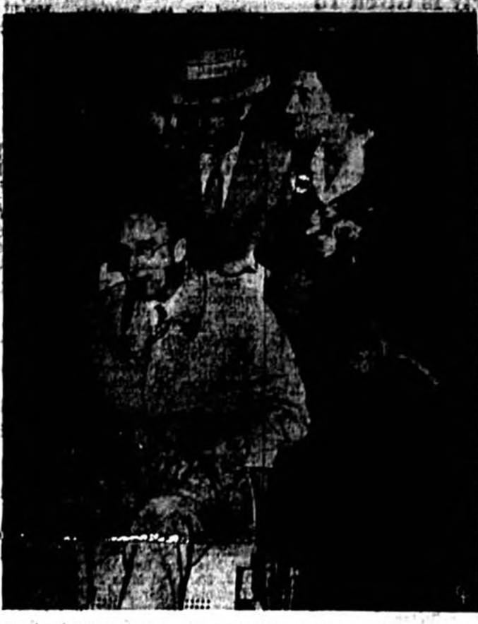
Professor Philip Jessup, of Columbia University, one of the five survivors of an air crash near Sao Paulo, Brazil, in which eight died, arrives at New York aboard the Brazil. He is accompanied by his wife. Prof. Jessup was awarded Brazil's highest decoration for his heroism in aiding victims.