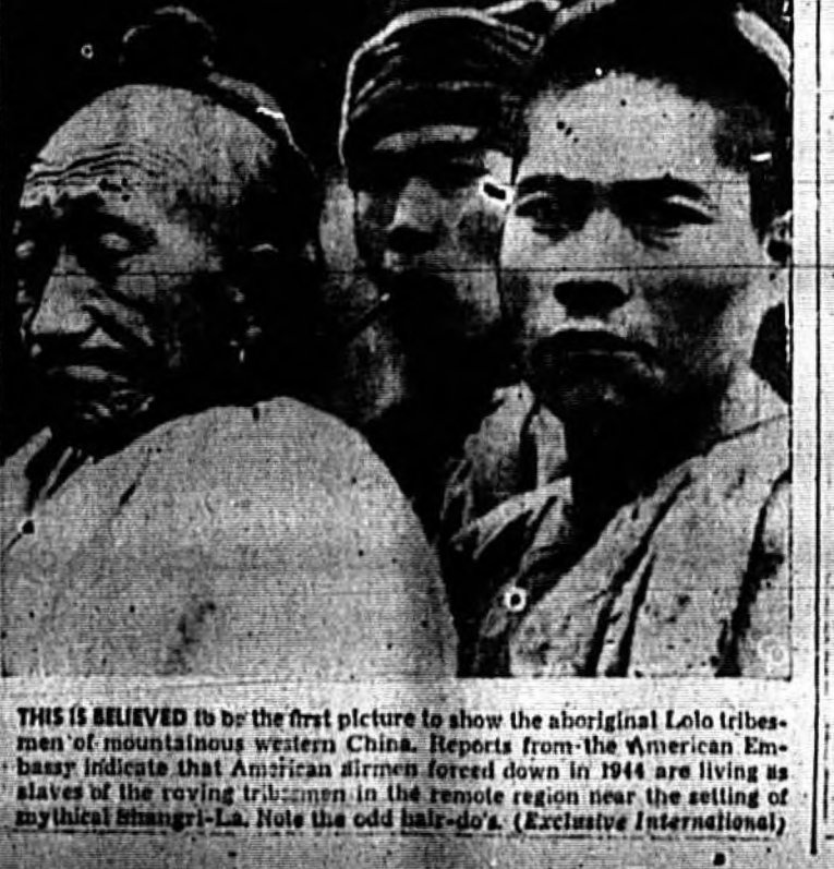
THIS IS BELIEVED to be the first picture to show the aboriginal Lolo tribesmen of mountainous western China.

TO LIMIT ENROLLMENT... Gainesville, Sept. 26—(AP)—The enrollment at the University of Florida for the spring term will be limited to 1,000 students.