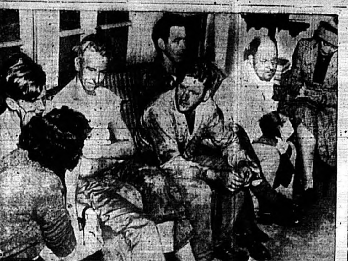
RESCUED BY THE TANKER GULFhawk, which brought them to Lovett, Del., five survivors of the Norwegian tanker Merit II, which broke in half and was lost in a hurricane off the North Carolina coast, are interviewed in Beaufort, N.C.