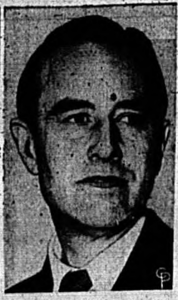
AMBASSADOR to the Court of St. James, W. Averell Harriman has been named by President Truman to succeed Henry A. Wallace as Secretary of Commerce. Harriman was envoy to Soviet Russia during the late war.

Most wild mammals are far from tame. There are seven different kinds sighted. A REMIND of fog.