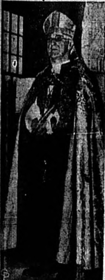
THE MOST REVEREND Geoffrey Francis Fisher, Archbishop of Canterbury, is shown after he had delivered a sermon at the Cathedral of St. John the Divine in New York City. The Primate of All England said that the weakness of the world is its lack of faith.

The population of Texas increased 287 percent between 1890 and 1940.