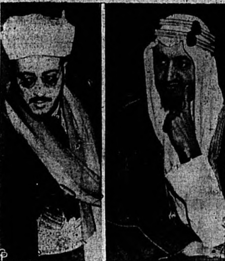
LEAVING A SESSION of the Palestine conference in London are two of the Arab leaders who rejected the proposed partition of Palestine. At left is King Abdullah of Transjordan. At right, the Emir Feisal of Saudi Arabia, whose expression may indicate his thoughts of the plan.

Most wild mammals are far from tame. There are seven different kinds sighted. A REMIND of fog.