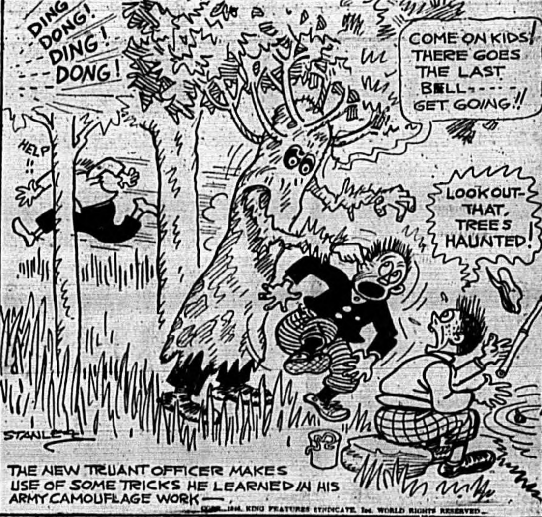
THE NEW TRIJANT OFFICER MAKES USE OF SOME TRICKS HE LEARNED IN HIS ARMY CAMOUFLAGE WORK