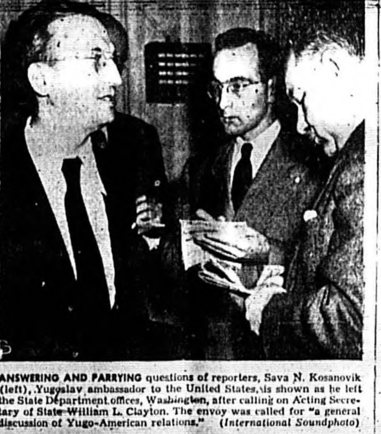
ANSWERING AND PARRYING questions of reporters, Sava N. Kosanovik (left), Yugoslav ambassador to the United States, is shown as he left the State Department offices, Washington, after calling on Acting Secretary of State William L. Clayton.