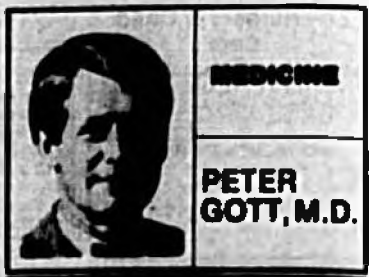
MEDICINE PETER GOTT, M.D.

DEAR READER: Such reports are erroneous. The risks of serious — even fatal — consequences of childhood illnesses far outweigh the risks of the vaccines. True, an occasional youngster can react badly to immu-