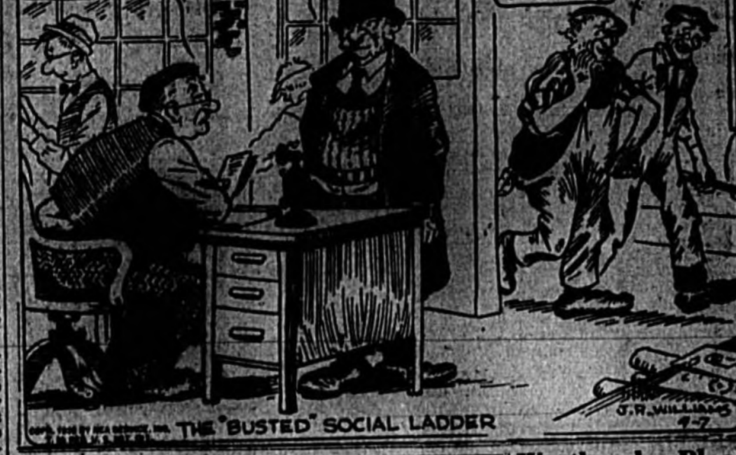
THE "BUSTED" SOCIAL LADDER

THAT'S WHERE HIS MOTHER IT AIN'T OVER! MY POOR GUY IS GONNA BE MADE MISERABLE BY REST OF HIS LIFE, NOW THAT HIS FAMILY HAS GOT USED TO LUXURIES BEIN' TH' NECESSITIES BEIN' LUXURIES!