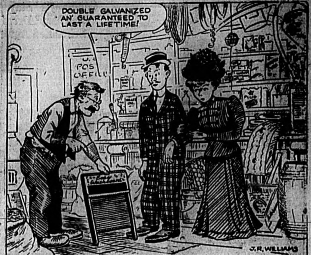
Too Late To Clamify

INSURANCE AGENTS to sell accident, health and hospitalization policies for large old company. Claims paid and policies issued from Daytona Beach. Apply Metropolitan Casualty Insurance Co. 230 Second Ave., Daytona Beach.