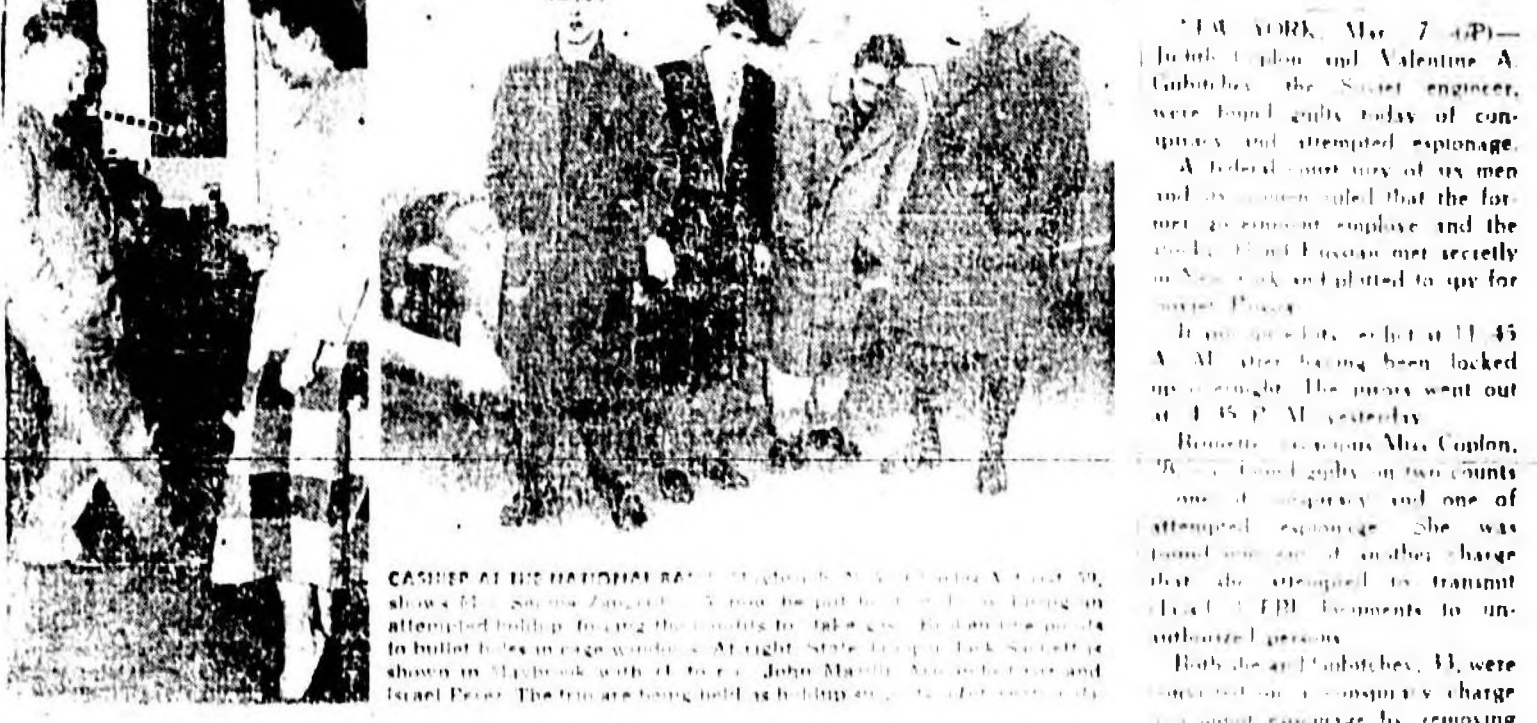
CASHER AT THE NATIONAL BANK OF NEW YORK, NEW YORK, MAR. 7. Shows El. Joseph Gubitchev, 40, who is put in jail for espionage, after attempted flight to the Soviet Union. He is charged with espionage for the United States and other western countries will have about Soviet spying.