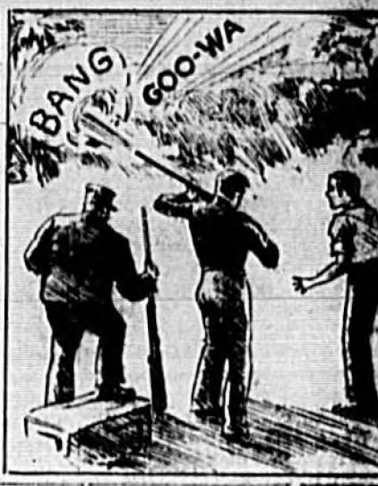
ALLEY OOP-Our t'rehistoric Ancestor