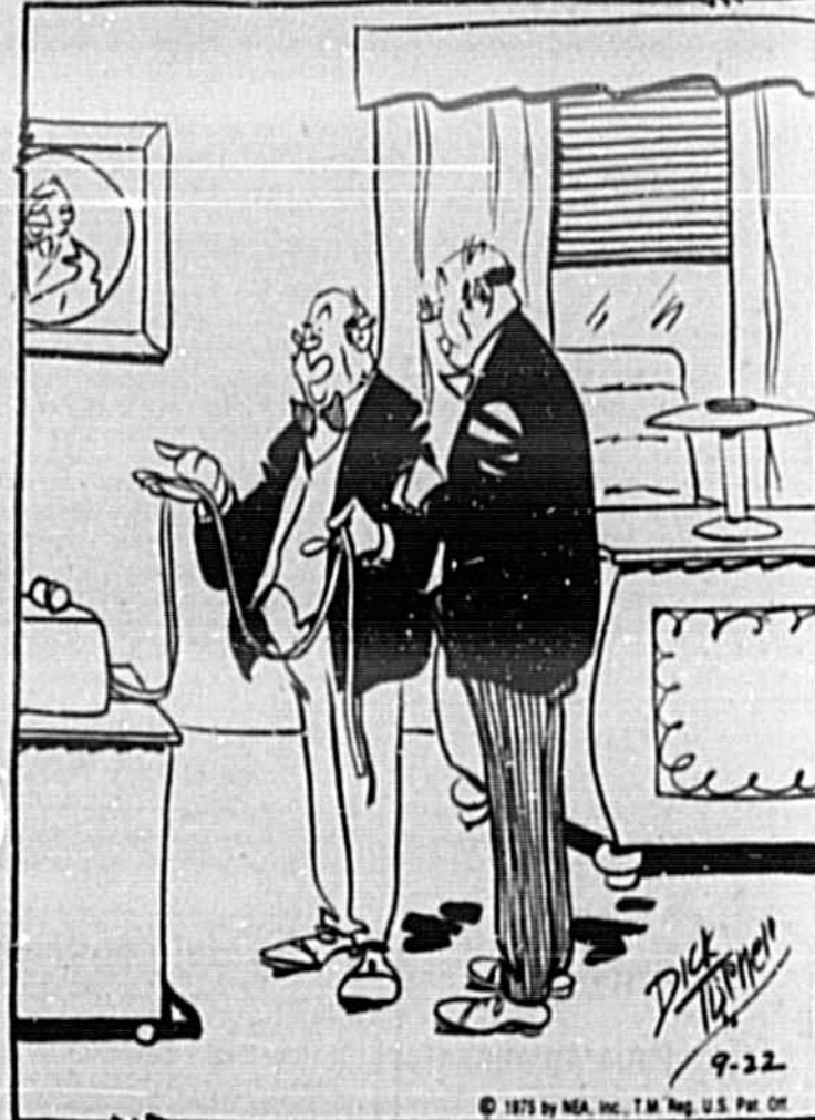
"Cotton futures are down, utilities are shaky, but pro football season tickets seem to be holding firm!"