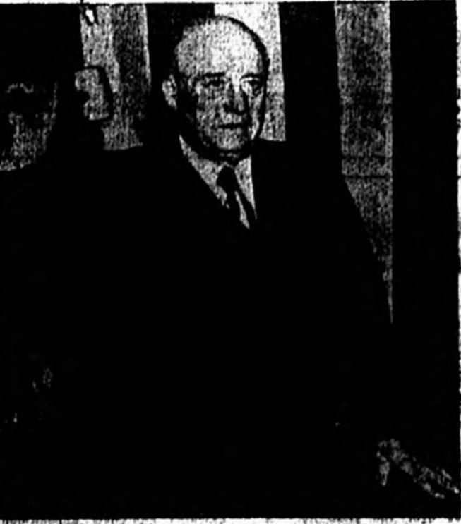
Speaker of the House Sam Rayburn bangs down his gavel to reconvene Congress after a ten-week recess. One of the prominent issues of the new session was the question of whether or not fathers shall be drafted.