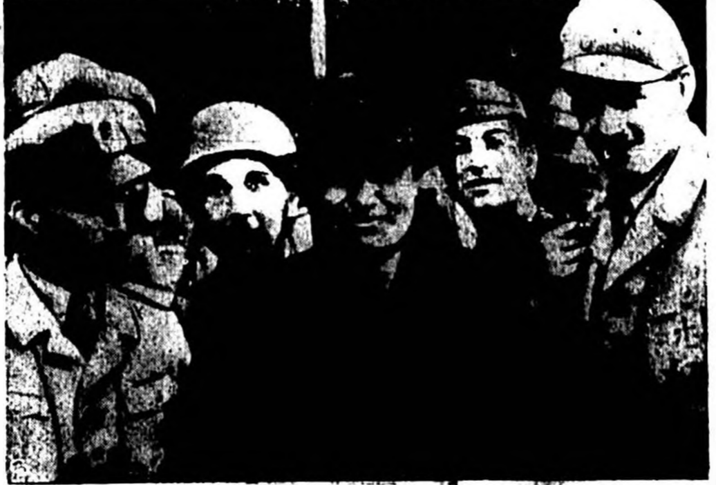
This photo just received from Sweden shows Benito Mussolini, deposed Italian leader, surrounded by German paratroopers who "rescued" him from his Italian guards. The picture was taken in front of a hotel in Gran Sasso, mountains, by the German government.