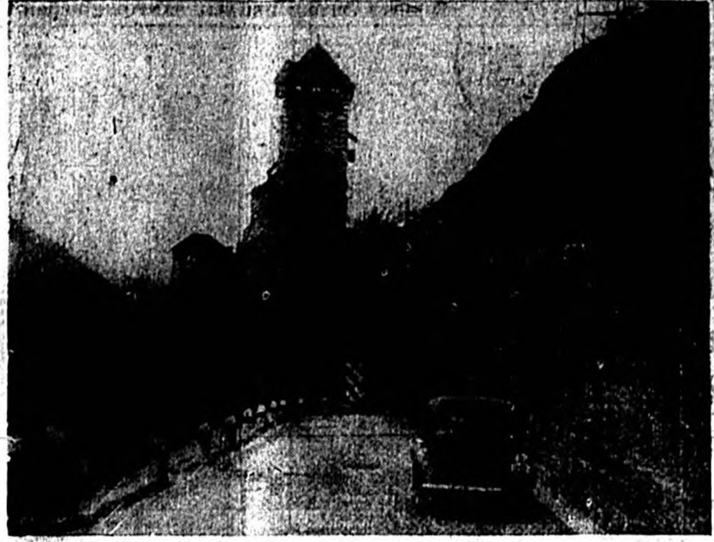
HAZEL IN THE ALPS was the headline of a photo, published before, was taken on the German side of the strategic pass and shows one of the many canals cut through the mountains. The pass was occupied by Italian troops, according to a report of a German broadcast, one day before the announcement of Italy's capitulation to the Allies.

Instead of selling through syndicates at generous commissions, the government sold to ordinary