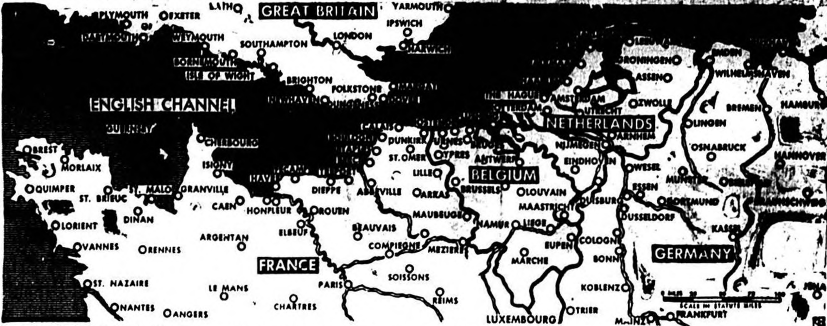
FACED BY THE GREATEST AIR ASSAULT in the war to date, Allied invasion forces demonstrated against the channel coast of France and the low countries in large scale maneuvers that may be the prelude to actual invasion. More than 1,800 Allied planes took part, bombing many important strategic and tactical targets along the southern coast of France without meeting serious opposition from the Luftwaffe. No attempt was made by the Nazis to interfere with the progress of the invasion fleet as it sailed for two hours toward the French coast under a perfect umbrella of fighter planes. So tremendous was the show, British coastal dwellers thought the real invasion was on. (Pictorialist's)