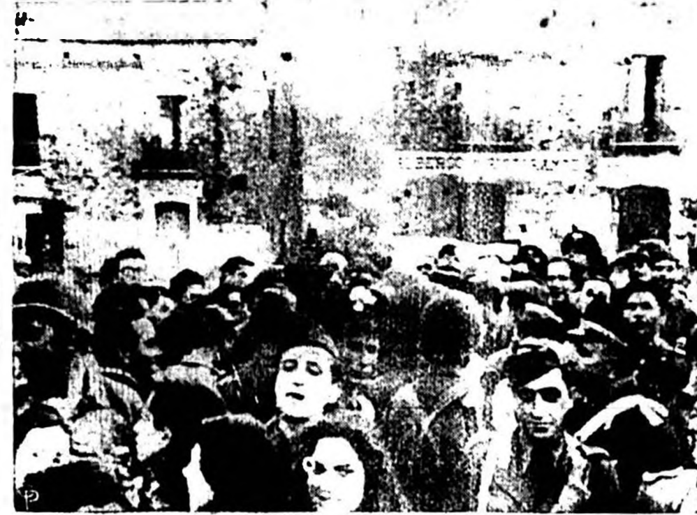
This picture, taken somewhere in Italy after the war, shows a group of veterans sitting on the floor of a room after the Yanks first set foot in the country.

ALL SOULS CATHOLIC CHURCH Pastor Sunday School, 10:45 A. M. Prayer Meeting, 11:00 A. M. Worship, 11:30 A. M.