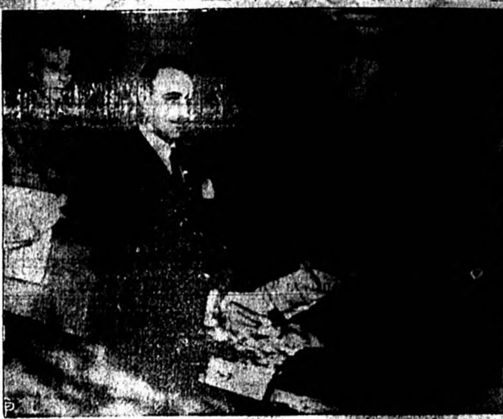
This picture was taken a few moments after the signing of the military armistice between Italy and the Allies. The signing took place on Sept. 3 at Allied Headquarters in Sicily. Representing Italy was Gen. G. Castellano, shown here shaking hands with Gen. Dwight D. Eisenhower, chief of the Allied Forces. At the left is Lt. Gen. W. B. Smith, U. S. Army, holding the document.

The German attack was repulsed by two days and the Allied command was reinforced with new units.