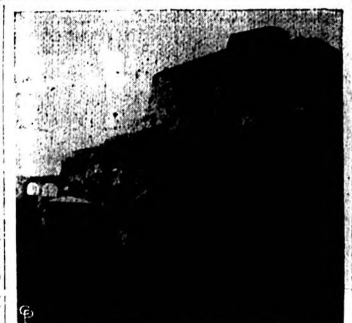
This fort high on a promontory at Scilla, Italy, is one of the points attacked and taken by invading Allied forces, according to the Berlin radio. Jutting into the Straits of Messina, it was a likefor pre-invasion hammering by Allied bombers.