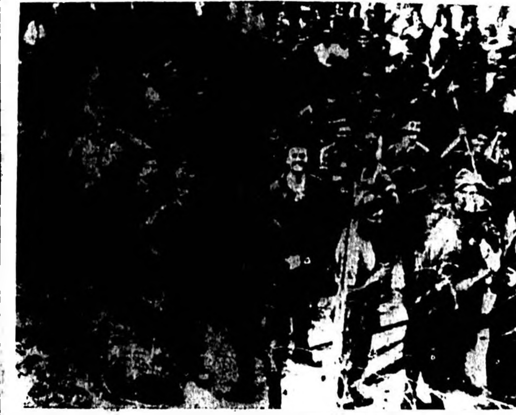
Standing behind logsely-strung barbed wire, these smiling Italians were among the first present taken by the invading Allied forces. They were captured and rounded as at traffice Marinu by mando units of the British Eighth Army shortly after a same had been made from Stelly in Italian mainland.  The constraint descendible to