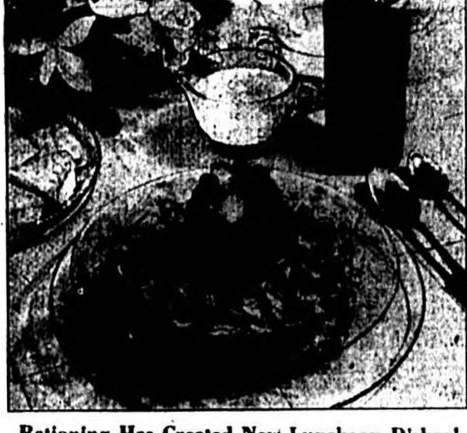
Rationing Has Created New Luncheon Dishes! WE can thank our red, white and no cooking required. "Toustles Wal-

W blue ration stamps for creating dorf" is just as good as it sounds. new foods and new combinations of On a heaping bed of crisp Post Toastles—in your gayest individual