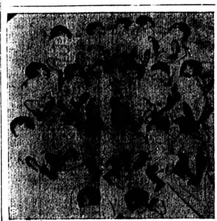
PIN-UP PICTURES are favorites with all branches of the armed services. A Marine Corps photographer assigned to get an original "cheesecake" picture at Quantico, Va., returned with this shot of twenty-five newly born children at the Quantico hospital