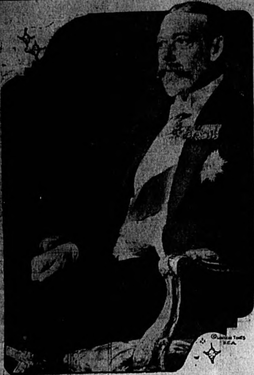
This is the latest portrait of the king of England, painted by Sir Arthur Cope, B. A., especially for the Royal College of Music. It is pronounced an excellent likeness.