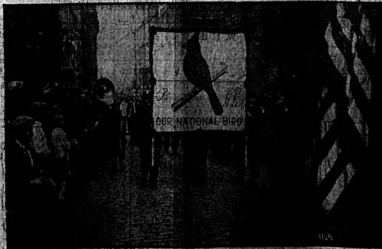
The red cardinal replaced the American eagle as the national bird—for St. Louis anyway—when Rogers Hornsby's Cards returned to the Missouri city after breaking even in the first two games of the world series at New York. This shows a banner borne through downtown streets in a boisterous parade of welcome.