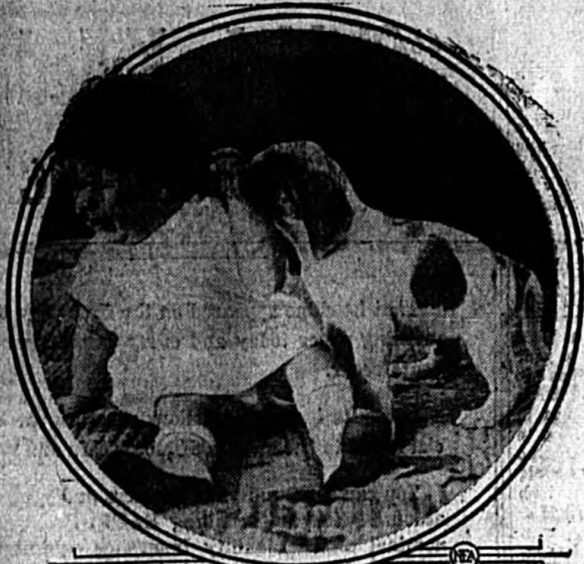
Little Billy isn't feeling so terribly playful right now, but Fido—or Sport or Buster or whatever his name is—wants to start something. Whatever he's suggesting doesn't seem to make much of a hit with his little master, anyhow.